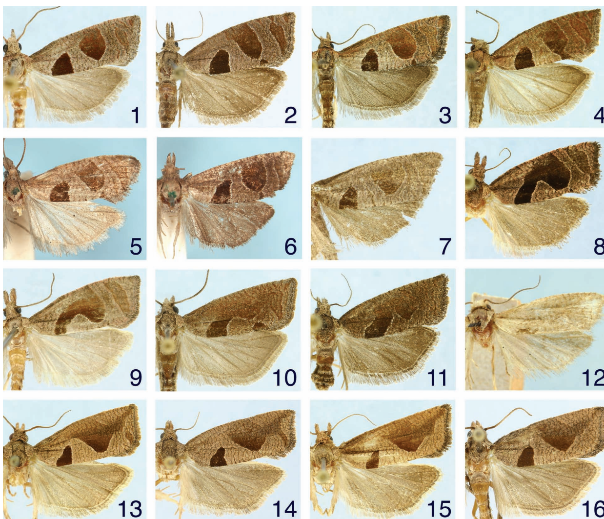
FIGS. 1–16. 1–7, E. dorsisignatana . 1, ♂, Adams Co., Ohio. 2, ♀, Ithaca, New York. 3, ♂, Larimer Co., Colorado. 4, ♂, Halifax, Nova Scotia. 5, P. clavata lectotype. 6, C. distigmata holotype. 7, E. d. diffusana lectotype. 8–9, E. similiana , form confluana . 8, ♀, Hamilton Co., Ohio. 9, ♂, Susquehanna Co., Pennsylvania. 10–11, E. similiana , form diffusana , ♂, ♂, Hamilton Co., Ohio. 12, E. engelana , lectotype. 13–16, E. oraria . 13, Holotype. 14, ♀, Accomack Co., Virginia. 15, ♀, Northampton Co., Virginia. 16, ♂, Worcester Co., Maryland.