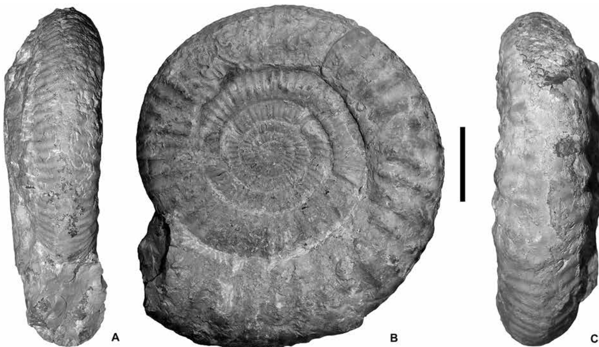
Fig. 1. Graefenbergites cf. arancensis (MELÉNDEZ, 1989), SMNS 70443. Semimammatum Horizon, Semimammatum Subzone, Hypselum Zone (Upper Oxfordian), Plettenberg Quarry near Balingen, Baden-Württemberg. A: ventral view, B: lateral view, C: ventral view opposite to A. Scale bar = 20 mm.

Material: SMNS 70443, probably a complete or nearly complete phragmocone, three-dimensionally preserved steinkern (Fig. 1A-C), found and mechanically prepared by the authors.