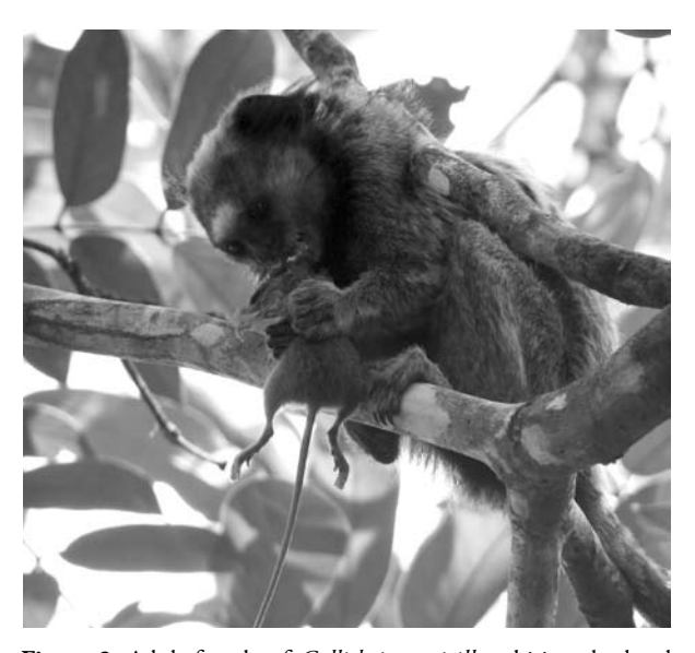
Figure 2. Adult female of Callithrix penicillata biting the head of a Mus musculus individual previously captured in the forest understory at the Jardim Botânico de Brasília.