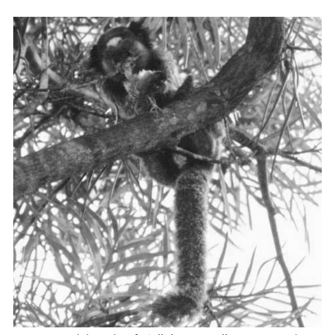
Figure 1. Adult male of Callithrix penicillata eating a dove ( Columbina talpacoti ) at the Estação Ciência São Jose.