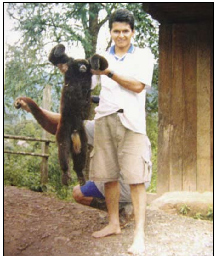
Figure 3. A farmer poses with a recently killed adult male Oreonax flavicauda , near the settlement of Afluente (Alto Mayo), Peru.

The campesinos of this area, and in all areas in the Bosque de Protección, are immigrants, former cerranos (people from the sierras) who fled to the area during the height of guerilla activity (mostly the Sendero Luminoso) during the 1970s and 80s. The prospect of free and unoccupied terrain enticed them further still and stimulated a greater influx that is still growing at an exponential rate. Most of the occupation occurred before the Bosque de Protección was decreed in 1987, but settlers continue to migrate to the area. As a result, the Department of San Martín has the third highest population growth rate in the country (4.7% over 10 years: Instituto Nacional de Estadística e Informática [INEI]—Estimaciones de Población por Departamentos, Provincias y Distritos, 1995–2000; San Martín, Peru).