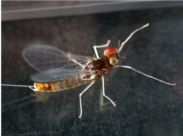
FIG. 2. Photograph of an adult mayfly gynandromorph (intersex) of Centropilum alamance showing the presence of both male and female morphological characters. The left eye (red) is male in size and shape, whereas the right eye is female. A male clasping appendage (forcep) is evident on the right side at the end of the abdomen but absent (as in females) on the left side.

produced bisexual offspring by mating a male produced parthenogenetically from a C. alamance gynandromorph with a female produced parthenogenetically (but not from a gynandromorph) and confirmed the biparental inheritance by genetic analysis using several marker loci. In addition, we reared males from eggs taken from parthenogenetically produced gynandromorphs of C. semirufum and A. pygmaea . For A. pygmaea , we also produced bisexual offspring by mating a parthenogenetically produced F1 male with a parthenogenetically produced female. Thus, males produced via parthenogenesis, while infrequent, were viable and fertile.