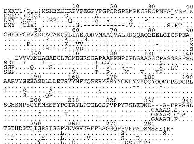
Fig. 2. Alignment of DMY and DMRT1 proteins in O. latipes (Ola) and O. curvinotus (Ocu). Period indicates sequence identity; dash indicates a gap; asterisk indicates a stop codon. The DM-domain occurs at positions 23–76. A single base pair deletion at position 272 of Ola DMY has caused a frame-shift mutation. The DNA Data Bank of Japan (DDBJ) accession numbers of the O. curvinotus DMY and DMRT1 cDNA sequences are AB091695 and AB091696.