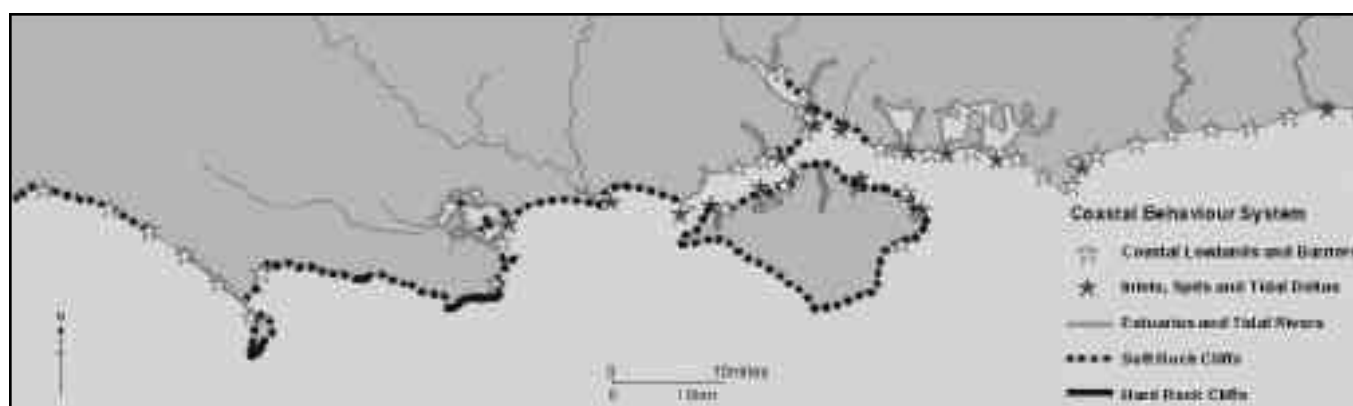
Figure 2. Distribution of SCOPAC Coastal Behaviour Systems