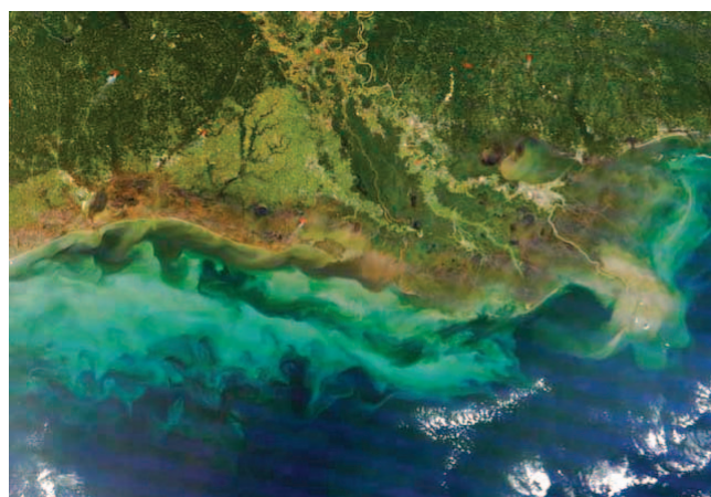
Figure 2. The moderate-resolution imaging spectroradiometer (MODIS) on NASA's Terra satellite captured this image on September 26, 2008, 13 days after Hurricane Ike came ashore. The brown areas in the image are the result of a massive storm surge that Ike pushed far inland over Texas and Louisiana, causing a major marsh dieback.

storm's surge. The powerful tug of water returning to the Gulf also stripped marsh vegetation and soil off the land. Therefore, some of the brown seen in the wetlands may be deposited sediment. Plumes of brown water are visible as sediment-laden water drains from rivers and the coast in general. The muddy water slowly diffuses, turning pale green, green, and finally blue as it blends with clearer Gulf water (NASA/GSFC, 2010; Ramsey and Rangoonwala, 2005).