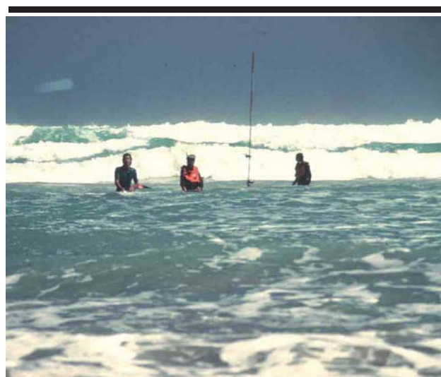
Figure 2. Deploying field equipment in the dissipative Goolwa surf zone, 1980. The aerial holds pressure sensors and current meters and indicates location in deeper water.

Buoyed with the success of these initial field experiments and boosted by an US Office of Naval Research (ONR) grant in 1980 it was decided to take on the high-energy southern Australian coast, at a site scouted by Short in 1978, Goolwa beach, South Australia (Figure 1). This beach is exposed to the