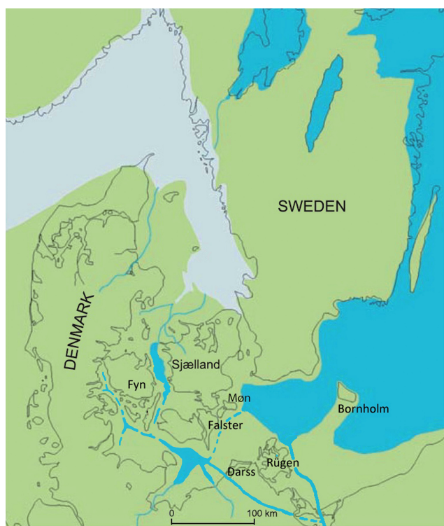
Fig. 4. The possible land sea configuration in the south-western Baltic ca. 10000 cal. yr BP, just prior to the onset of the transition from the Lake Ancylus to the initial Littorina Sea. Neither was there a permanently flowing water body in the Great Belt nor between the Iles of Møn and Falster in the Northwest and Ruegen Island and the Darss Peninsula in the Southeast.

and Bornholm to its contemporary position in the Oderhaff estuary (Kolp 1983, Hoffmann 2002). For example, according to nautical charts the drowned old Oder valley is situated east of Ruegen at about 25 m below sea level. The River Oder can be said to have formed a hazel dormouse immigration barrier giving a good explanation why the hazel dormouse is absent on Bornholm.