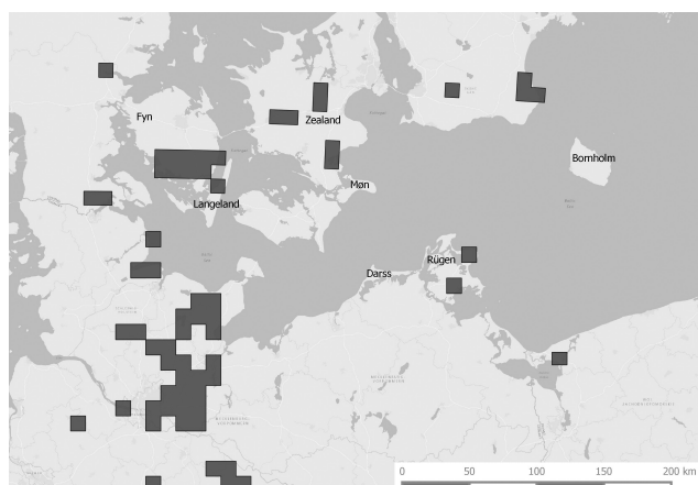
Fig. 1. Distribution of hazel dormice in the southern Baltic; remark by the authors of this paper: no proof of the record on the north-west corner of Poland near the German border could be found so far.

evidences for such conditions during the 12000 years after the last glaciation?