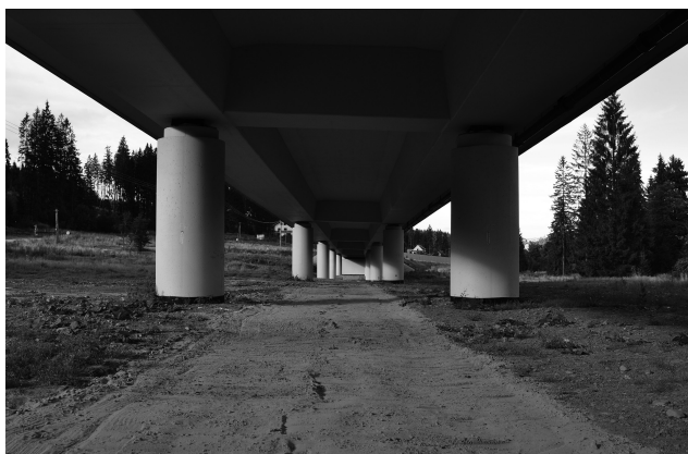
Fig. 2. The wildlife crossing structure underpass near Laliki village on the S69 express road in western Polish Carpathians.

identified with the help of field guides (Jędrzejewski & Sidorovich 2010), by biologists experienced in mammal tracking.