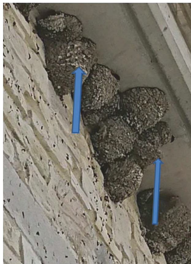
Fig. 2. A colony of house martins in which house sparrows have succeeded in appropriating nests at the 'cup' stage and successfully laid their own eggs in them (arrows). Completed and occupied house martin nests are evident around these usurped nests.

Upon continued attempts by the house sparrows to take over the partially built nest (Fig. 1), we observed a shift in the behaviour of the house martins. Observations were recorded on a cellular phone as photos and short video-clips.