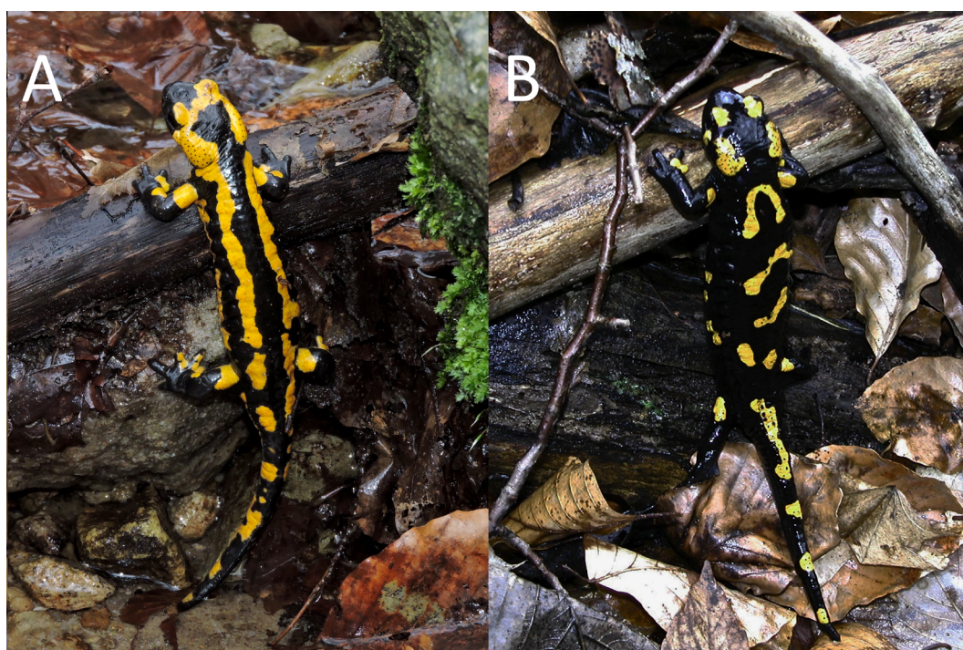
Fig. 1. Colour pattern phenotypes of fire salamanders ( Salamandra salamandra) from the studied area. A) the striped phenotype from north-western Bohemia, Czech Republic. B) the spotted phenotype from central Bohemia, Czech Republic.