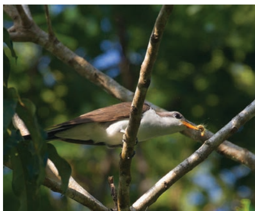
Figure 2. Pearly-breasted Cuckoo Coccyzus euleri , Risquetout forest, Macouria, French Guiana, 10 August 2013