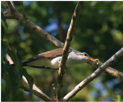
Figure 2. Pearly-breasted Cuckoo Coccyzus euleri , Risquetout forest, Macouria, French Guiana, 10 August 2013 (F. Royer)