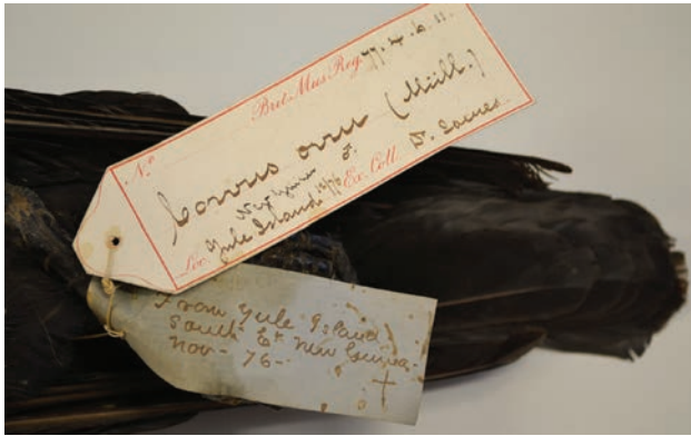
Figure 1. Torresian Crow Corvus orru with a British Museum label and original label in Dr James' handwriting

subspecies has been tentatively listed as the Papuan Trumpet Manucode in the BirdLife Australia subspecies list. It is listed because it occurs in the Torres Strait Islands, but other subspecies of Trumpet Manucode occur on mainland of New Guinea so this name appears inappropriate. Instead, I suggest the common name Dr James' Trumpet Manucode be adopted in Australia for this taxon.