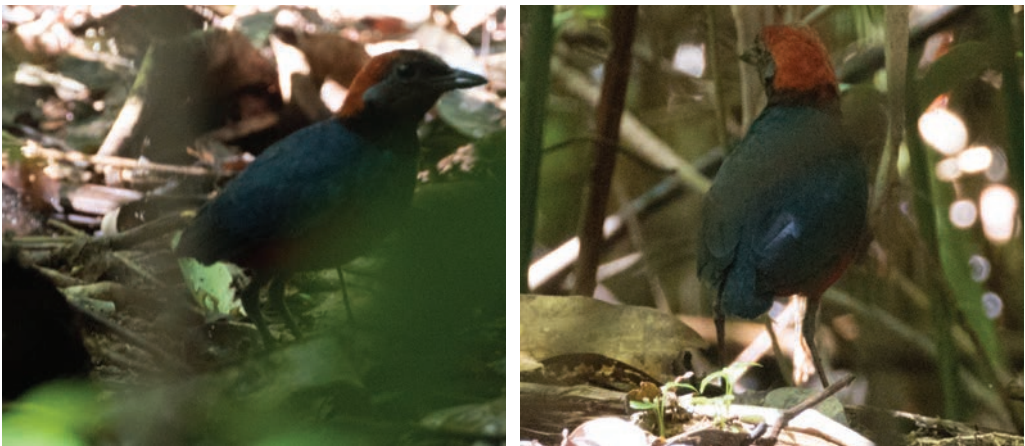
Figure 1A–B. Tabar Pitta Erythropitta splendida , southern Tabar Island, New Guinea, 31 July 2016 (Markus Lagerqvist)