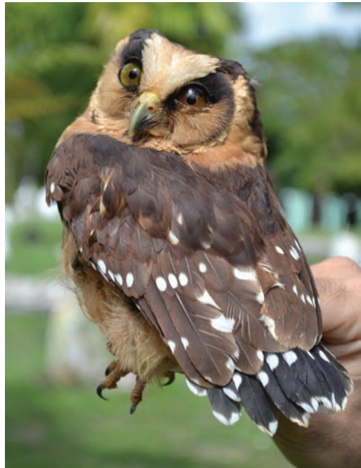
Figure 2. Heterochromia iridis in Buff-fronted Owl Aegolius harrisii at Parque dos Falcões, Itabaiana, Sergipe, Brazil (Juan Ruiz-Esparza)

A. harrisii appears to be relatively rare, and is poorly known in museum collections (Studer & Teixeira 1994, Marks et al. 1999), which hampers systematic analysis of its biology or distribution. The available records do, however, suggest that the species is uncommon and patchily distributed (Stotz et al. 1996). While few records are available from north-east Brazil, mainly from Ceará (Table 1), they indicate that the species is perhaps adapted to the arid Caatinga , and may be a habitat generalist. The present record, together with other