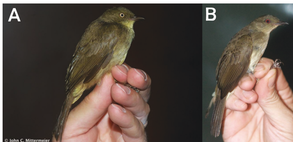
Figure 3. Photographs from Lambir Hills National Park, Miri Division, Sarawak, Malaysia of (A) Cream-eyed Bulbul Pycnonotus pseudosimplex sp. nov., and (B) Cream-vented Bulbul P. simplex

in being yellower on the throat and vent, creating greater contrast with the darker breast and flanks. From P. cinereifrons , P. pseudosimplex differs in being much smaller: P. cinereifrons mean 31.7 g ( n = 3 ); P. pseudosimplex mean 20.7 g ( n = 11 ). P. cinereifrons also has an olive tinge to the leading edge of its remiges, which is especially obvious on the folded wings of specimens (similar to P. plumosus of Borneo). From P. brunneus , P. pseudosimplex differs in having a white iris instead of an orange or two-toned iris. Similarly, P. erythrophthalmos differs in having a dark red iris and a circle of yellow skin around the eyes.