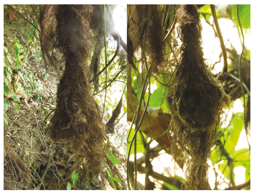
Figure 5. Nest of Spotted Tody-Flycatcher Todirostrum maculatum constructed on the root of a Capsiandra sp. (Fabaceae) near the Madeira River, Rondônia, Brazil, July 2018 (Tomaz Nascimento de Melo)