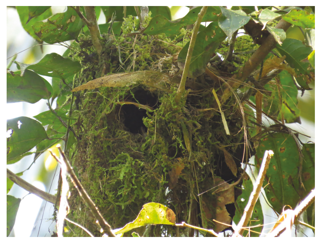
Figure 4. Nest of Specked Spinetail Cranioleuca gutturata in floodplain várzea forest, Rondônia, Brazil, June 2018

On 15 June 2018 a nest under construction was found in a lowland forest, c .200 m from the Phaethornis hispidus nest described above. An adult was observed collecting green mosses in a nearby tree and depositing the material in the nest, which was a globular closed construction c .200 mm tall, of dry leaves and green mosses, especially the latter (Fig. 4), with a lateral entrance. The nest was sited on the fork of a branch of Protium sp. (Burseraceae), c .7 m above ground. On returning to the site on 10 July, the nest was apparently empty and no adult was observed. It is unknown whether the nest had been abandoned or not. There are very few published data concerning the species' breeding biology: Remsen (2003) mentioned nestbuilding in mid August in Peru, and the nest reported here was obviously similar to that described previously. A nest found in January, also in Brazil, was of similar shape and size, but with less green moss used in the construction (D. P. Fernandes; https://www.wikiaves.com/1234488).