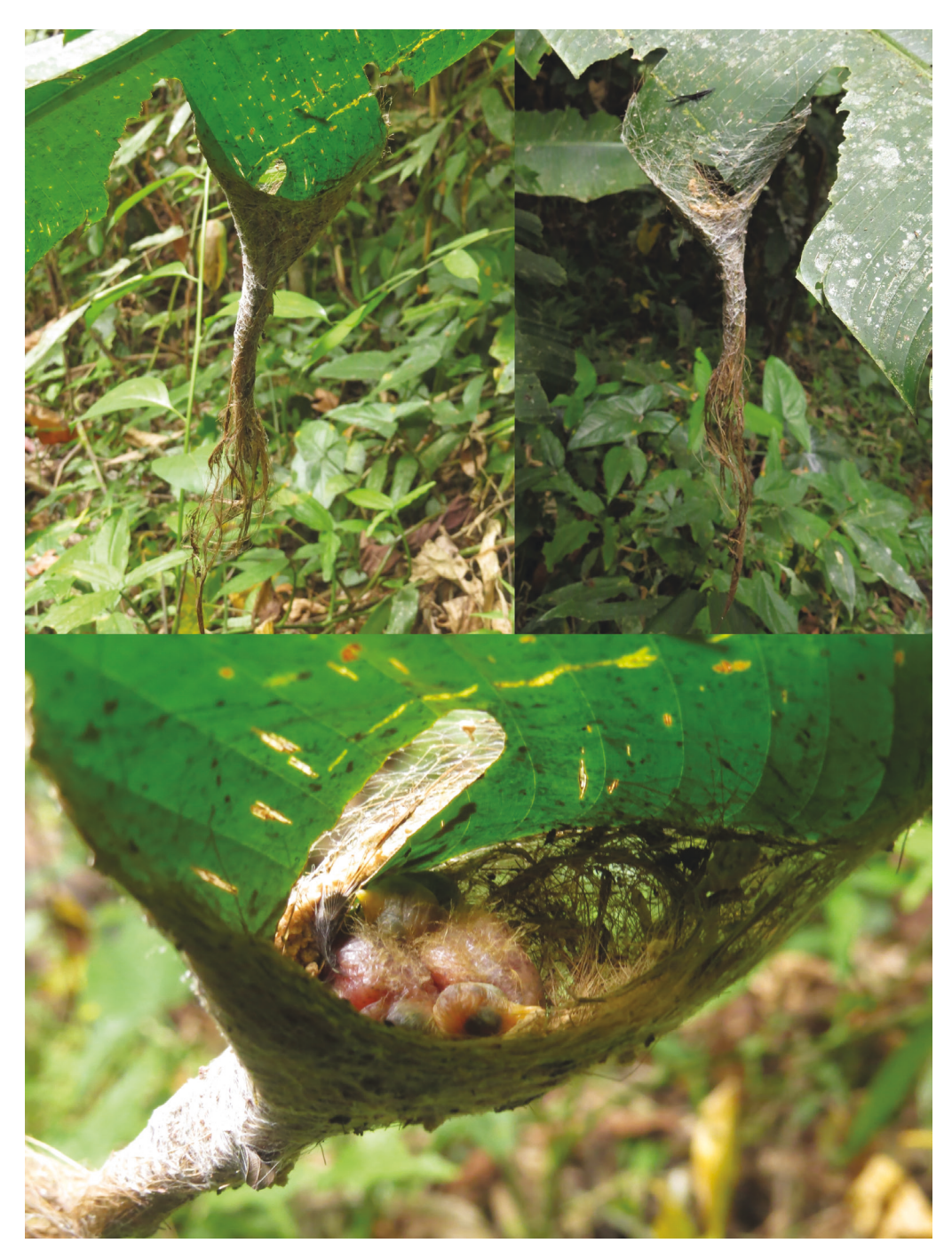
Figure 1. White-bearded Hermit Phaethornis hispidus nest with two nestlings, Rondônia, Brazil, June 2018 (Tomaz Nascimento de Melo)

was sited 1.01 m above ground in a Costus (Costaceae) plant (Fig. 1). The cup measured 31 × 52 mm internally, and was 130 mm tall externally, with an elongated 'tail' of 70 mm at the base of the cup. The nest comprised fine, pale, dry palm fibres, tightly bound with spider webs, and attached to the underside of a damaged strip of leaf. Overall, the nest's