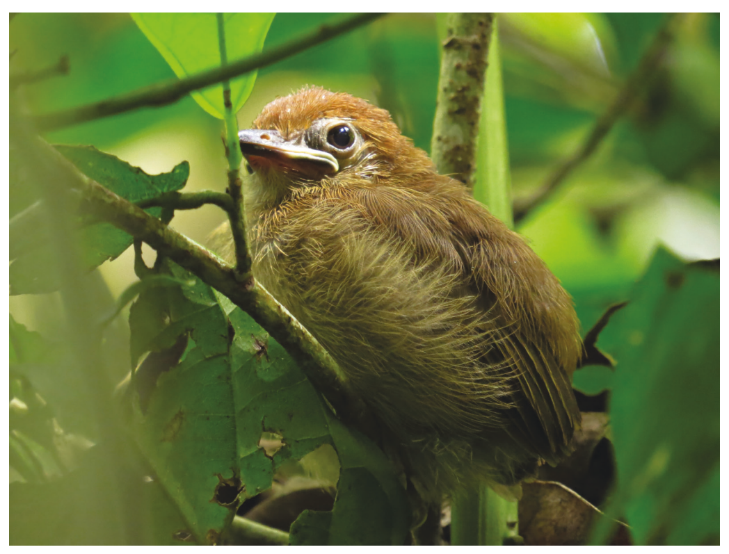
Figure 2. Plain-winged Antshrike Thamnophilus schistaceus fledgling, Rondônia, Brazil, June 2018

shape, composition, height and attachment were similar to those of a nest of the species found in June 2016, in Mato Grosso state, Brazil (C. P. Figueiredo; https://www.wikiaves. com/1234488). The elongated leaf of Costus sp. used here, offered a similar substrate to the leaves of understorey palms, which are among the most frequently used nest substrates of the genus Phaethornis (Ruschi 1949, Oniki 1970, Greeney et al. 2018).