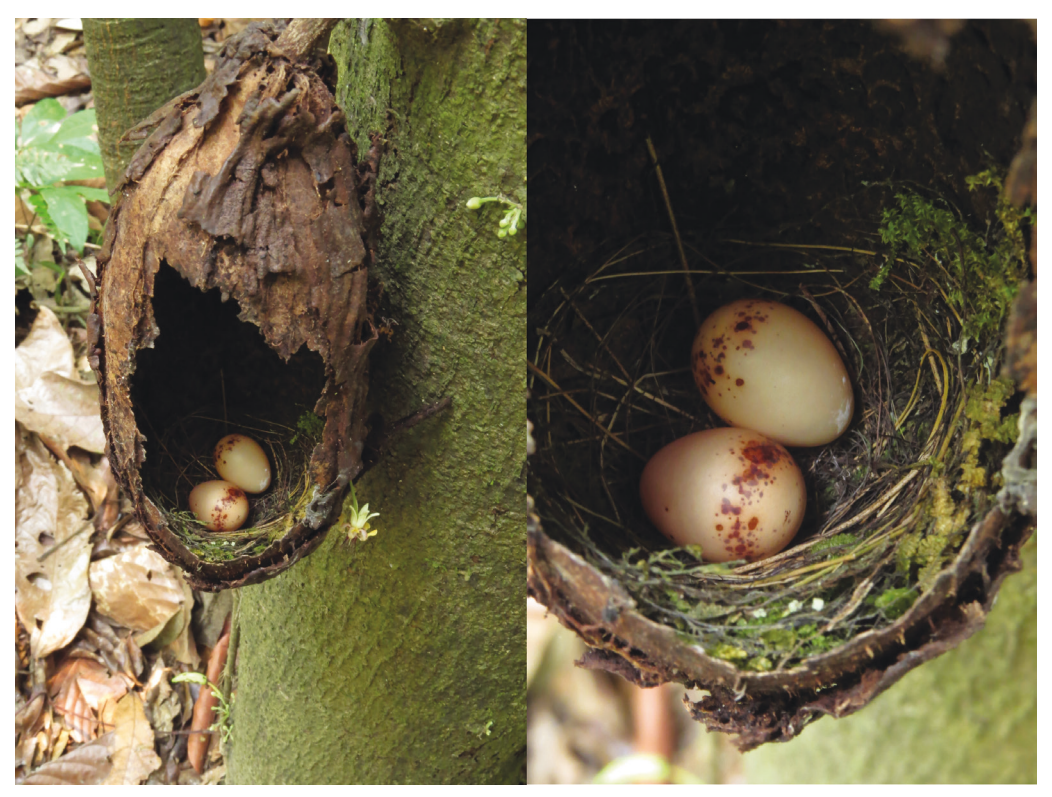
Figure 6. Nest and eggs of Euler's Flycatcher Lathrotriccus euleri in a dried cocoa Theobroma cacao fruit (Malvaceae), Rondônia, Brazil, September 2017

and south-east of its range is well known (Di Giacomo & López Lanús 1998, Aguilar et al. 1999, Marini et al. 2007, Auer & Bassar 2009). There, nests are shallow cups constructed in natural cavities in trees, fallen logs or in ravines, with a mean height above ground of 2 m. The clutch is two or three eggs.