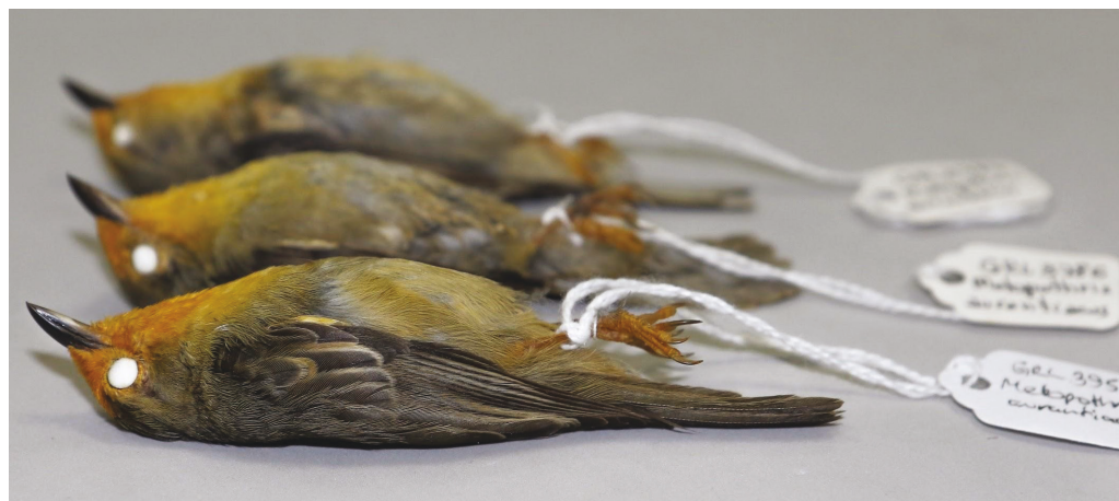
Figure 3. Recent Orange-fronted Plushcrown Metopothrix aurantiaca specimens collected in November 2017 west of Codajás, Amazonas, Brazil (two in background; GRL 3786, GRL 3787) and west of Manacapuru, Amazonas, Brazil (foreground; GRL 3952), housed at the collection at the Instituto Nacional de Pesquisas da Amazônia, Manaus (Cameron L. Rutt)

of Metopothrix was part of a cohesive mixed-species flock. The two birds remained high in the canopy of an emergent tree and neighbouring tall trees where mature várzea borders a strip cleared for sparse habitation. This area is c.800 m from the nearest large river and was not flooded at the time. We presumed the birds to be a pair as one (the putative male) had a much more saturated orange forehead and more vividly orange legs and feet ( http://www.wikiaves.com/2855507 ).