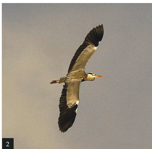
Figure 2. Adult Grey Heron Ardea cinerea , Fernando de Noronha, Pernambuco, Brazil, March 2018; the main field marks separating it from Great Blue Heron A. herodias are the white (vs. cinnamon) carpal joint, yellow bill and white forehead (Andrew Whittaker)

AW & JPFS encountered an adult on Ilha do Chapéu in the evening of 29 March 2019, perched at the edge of the island in the sun c.300 m away. Subsequently, the bird took off, gaining height as it flew around the coastal inlet, and was photographed as it flew off west.