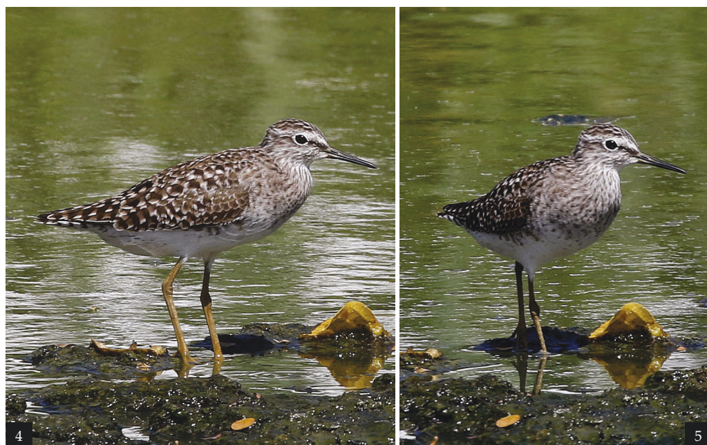
Figures 4–5. Adult Wood Sandpiper Tringa glareola , Fernando de Noronha, Pernambuco, Brazil, March 2018; note the long bold white supercilium (reaching well behind the eye), boldly checkered upperparts, long yellowish-green legs, and prominently marked upper breast

South and South-East Asia, the Philippines, Indonesia, New Guinea and Australia (van Gils et al. 2019).