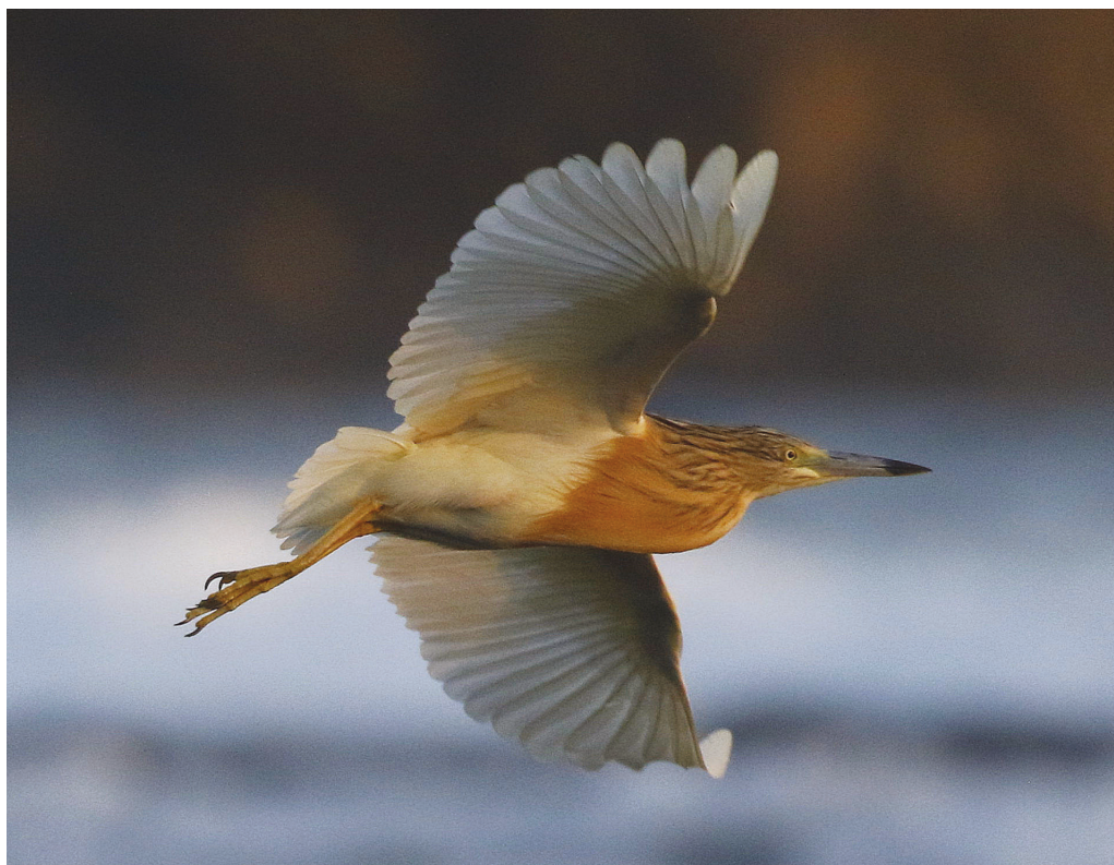
Figure 1. Adult Squacco Heron Ardeola ralloides , Fernando de Noronha, Pernambuco, Brazil, March 2018; now a common sight along rocky coasts of the main island and at freshwater pools

Squacco Heron appears to represent a rare example of a successful transatlantic colonisation event, with the first mainland Brazilian record reported in March 2018 (see