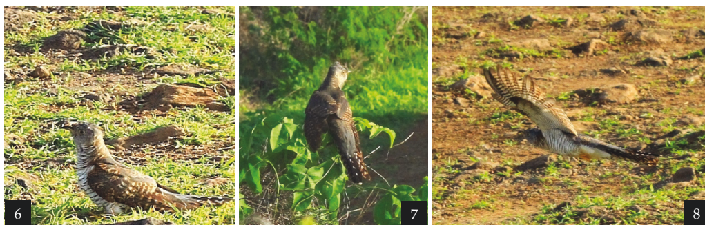
Figures 6–7. Common Cuckoo Cuculus canorus , Fernando de Noronha, Pernambuco, Brazil, February 2018; note long pointed wings and tail, the small amounts of grey plumage already appearing and lack of rufous wash to the upper breast, clearly confirming it to be a first-year male moulting into adult plumage (Breno Lucio)