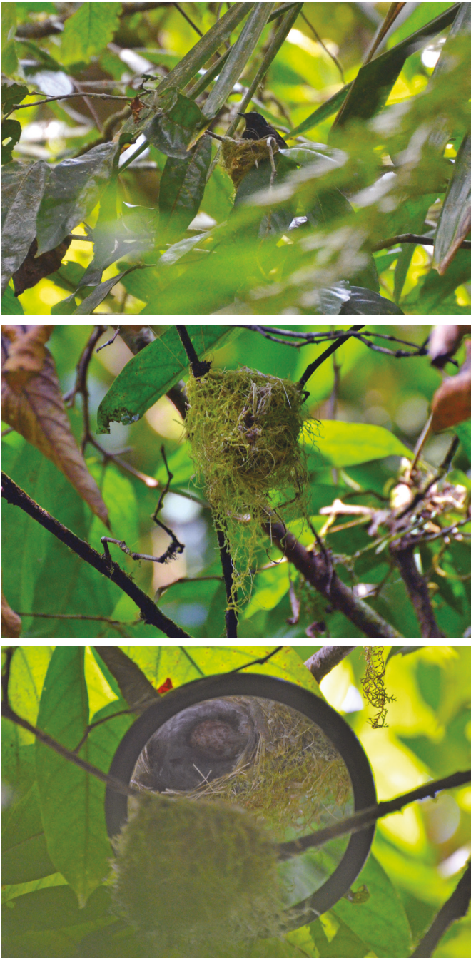
Figure 1. Two nests of Natewa Silktail Lamprolia klinesmithi , Natewa Peninsula, Vanua Levu, Fiji: (a) nest 1 with the adult perched on the rim, (b) nest 3 and (c) the egg in nest 3 shown in the reflection of the mirror

When brooding the adult regularly sat upright and tended the chick or nest briefly before either leaving the nest or re-assuming the usual low-slung position in the nest. The bird would leave silently, dropping straight down from the nest very rapidly and always in the same direction. There was an observed preference for facing away from the apex of the fork and trunk of the tree. At least six L. klinesmithi were regularly seen in the immediate vicinity of the nests. At times up to four individuals would pursue each other swiftly through the