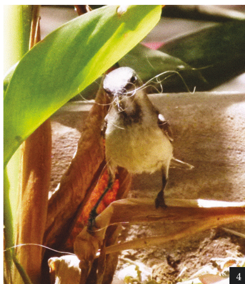
Figure 1. Breeding male Beautiful Long-tailed Sunbird Cinnyris pulchellus without tail-streamers, Brusubi, The Gambia, 11 March 2014 (Dave Montreuil)