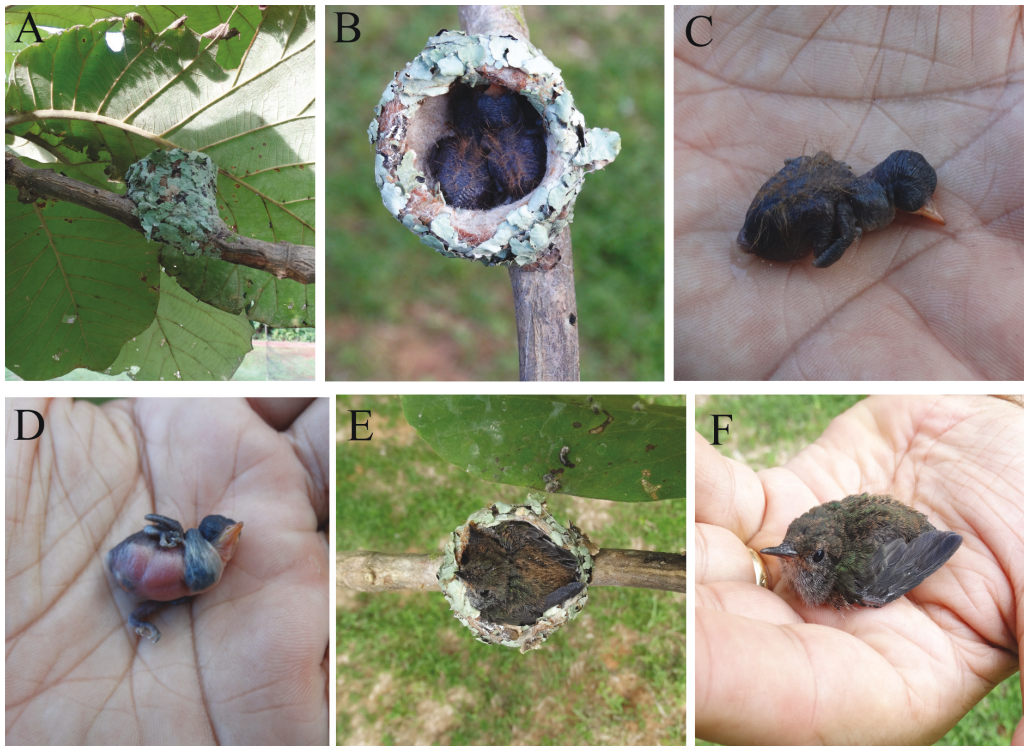
Figure 2. Nest of Sapphire-spangled Emerald Amazilia lactea bartletti with two nestlings on a horizontal branch of Tectona grandis : (A) outer nest wall showing lichen ornamentation; (B) dorsal view of nest with recently hatched nestlings (2–3 days old); (C–D) dorsal and ventral views of a nestling on the day it was found (23 March 2017); (E) feathered nestlings on 30 March 2017; (F) nestling on the day it was banded (4 April 2017) (Edson Guilherme)