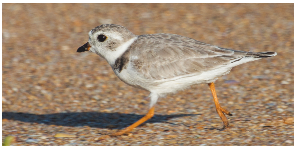
Figures 2–3. Non-breeding Piping Plover Charadrius melodus , Playa El Pico, western Paraguaná Peninsula, Falcón, Venezuela, February 2018 (Jhonathan Miranda)

crown by a broad white supercilium, creating a plain face, within which the large black 'button eye' was prominent, producing an overall 'innocent expression'. The sooty lateral breast-band was the darkest area of feathering, with no black in the rest of the plumage. This is the first record for Venezuela and the second for continental South America.