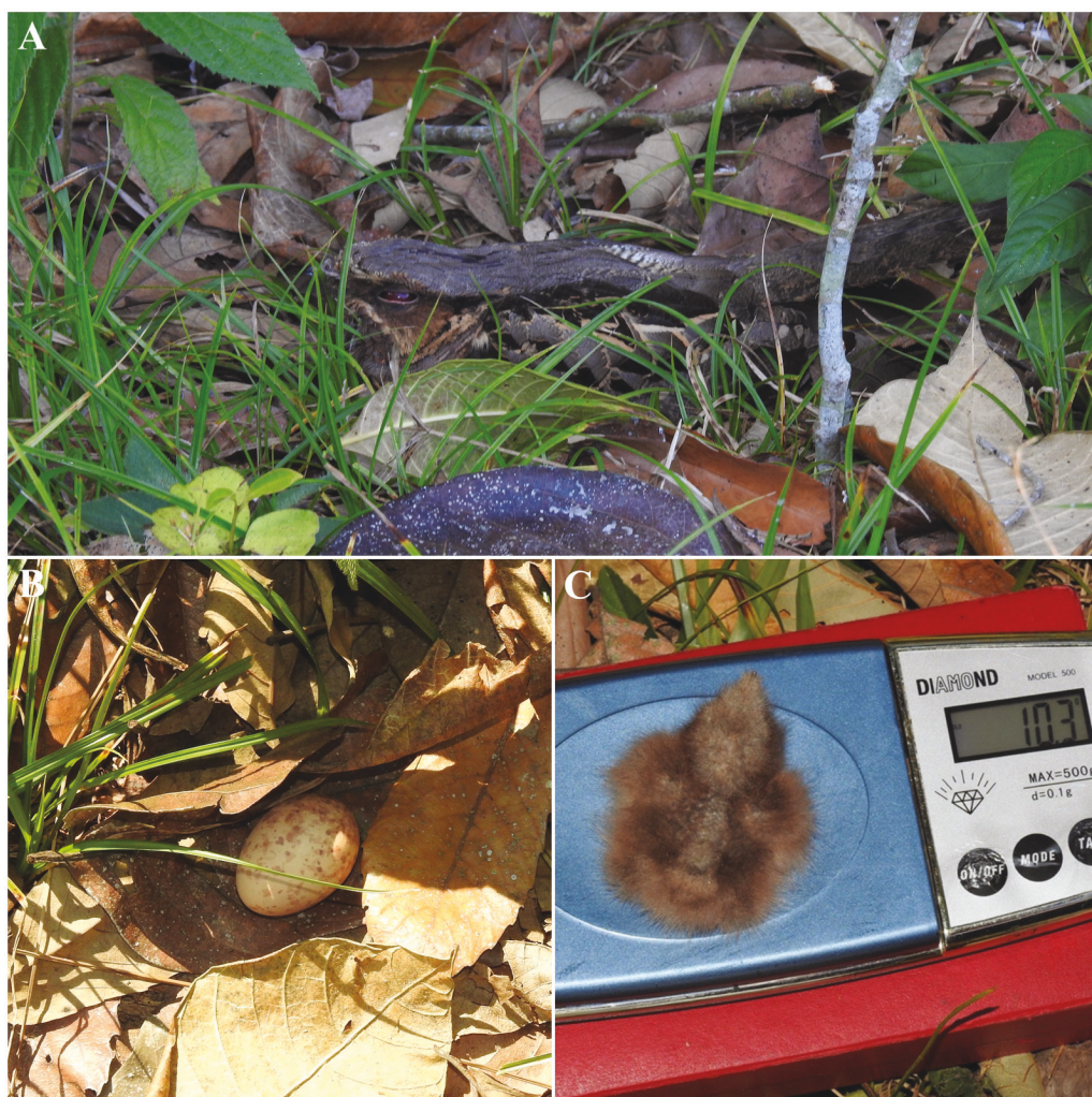
Figure 1. Active nest of Common Pauraque Nyctidromus a. albicollis in a forest fragment in south-west Amazonia (nest 18, Table 1): (A) adult incubating; (B) view of the egg; (C) nestling on the day it was weighed (Edson Guilherme)

The shape and colour of the eggs were compatible with previous descriptions from various regions (Ihering 1900, Hellebrekers 1942, Thurber 2003, Vasconcelos et al. 2003). Egg measurements were similar to those presented by Ihering (1900) and Alvarenga (1999) from São Paulo, Vasconcelos et al. (2003) in Minas Gerais, Haverschmidt (1968) in Suriname, Ingels (1975) in French Guiana, and Thurber (2003) in El Salvador. However, the eggs we measured averaged larger than those presented by Euler (1900) in Brazil (locality unknown) and Luz et al. (2011) in Rio de Janeiro. Mean egg mass was compatible with the averages presented by Latta et al. (2020) from several countries, including Brazil. However, the mass of eggs and newly hatched chicks were greater than those presented by Luz et al. (2011) from Seropédica, Rio de Janeiro. It is unknown whether these differences would prove consistent given large sample sizes, and if they are related to latitude or subspecific differences ( N. a. albicollis vs. N. a. derbyanus ). Unfortunately, we were unable to weigh nestlings older than two days after hatching because they move and remain hidden