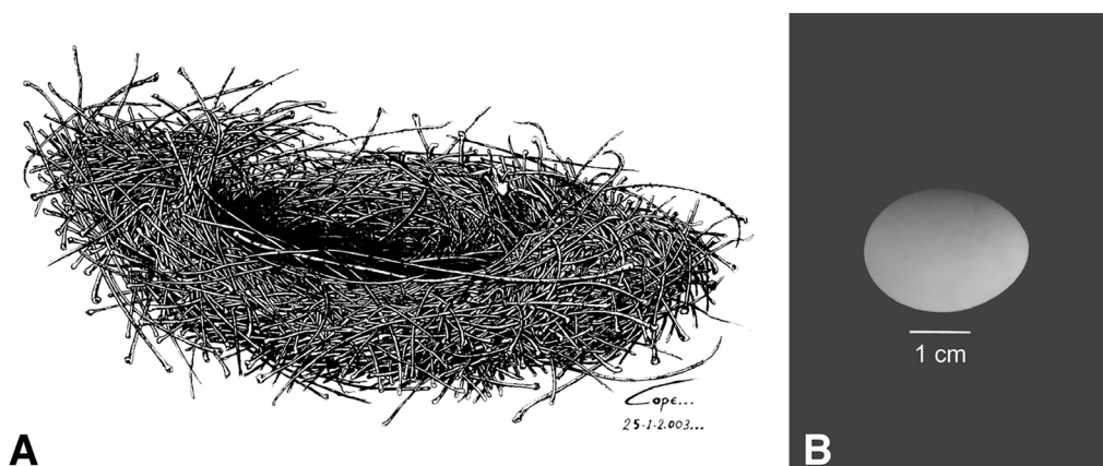
Figure 1. (A) Nest of Striped Woodhaunter Automolus subulatus virgatus , collected at Finca Rafiki, Santo Domingo, Perez Zeledón, San José Province, Costa Rica (nest 2) (© Alberto Pérez). (B) Immaculate white egg found in the nest (Karla Conejo-Barboza)

accompanied the nest (MZUCR-H205; Table 1; Fig. 1B) but the specimen label provides no details regarding clutch size or egg development. The size of the hole opened in the egg, however, suggested that it may have contained a well-developed embryo when collected.