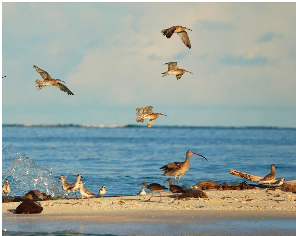
Figure 5. Eastern Curlew Numenius madagascariensis with Whimbrel N. phaeopus , Grey Plover Pluvialis squatarola and Lesser Sand Plover Charadrius mongolus , Xaheihon, Ninigo Islands, October 2019 (Sue Muller Hacking)

Hermits Bell (1975) recorded >20 on Luf in August. 9 February 2019: four in flight on Pemei; 10 February, one in flight on Pemei.