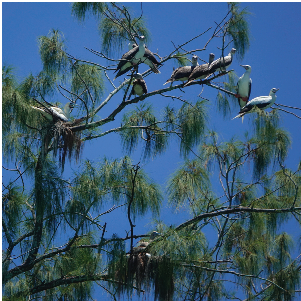
Figure 4. Nesting Red-footed Boobies Sula sula , Pianau, Hermit Islands, October 2019

Hermits 3 October 2019: Pianau c.300, with 124 nests (17 with chicks) mostly high on open branches of Casuarina with a few in dense mangrove (Fig. 4); on Pekhu, c.200 birds and at least 40 active nests, a few with chicks (photographed); and on Leabon, the smallest island, with fewest Casuarina , c.100 with c.10 nests (2–3 with chicks) (SMH). These are the first observations of nesting in Northern Melanesia west of Tench, and also apparently the first of the species breeding in Casuarina trees (Schreiber et al. 2020).