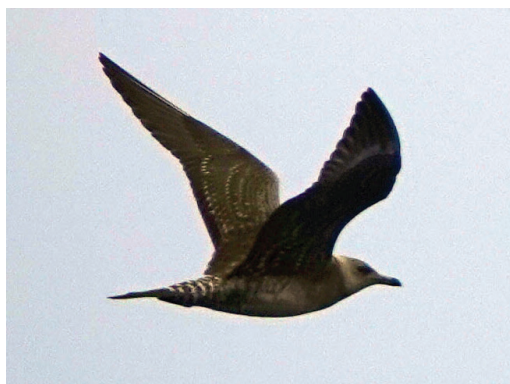
Figure 6. Juvenile Long-tailed Jaeger Stercorarius longicaudus , near the West Melanesian Trench, October 2019

Ninigos 14 October 2019: a first-year with a flock of feeding seabirds 260 km west of the Ninigos, at the edge of the West Melanesian Trench (Fig. 6).