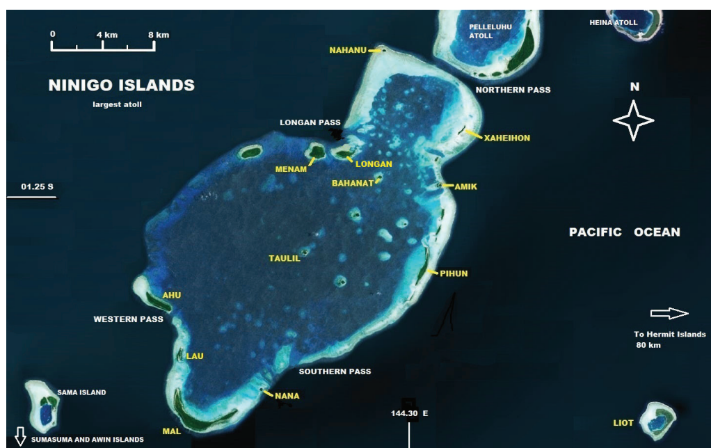
Figure 3. The main Ninigo Atoll, showing all of the islets mentioned in the text (based on www.Bing.com/maps/aerial ).

where they were collected was initially taken from WFC's unpublished diary. This was subsequently amended following reference to the American Museum of Natural History, New York's (AMNH) online catalogue, which is based on WFC's specimen label data. To our knowledge, the Kaniets and Sae have not been surveyed ornithologically since WFC's visit, but in 1970, Lt.-Col. Harry Bell camped on Menam, in the Ninigos, on 10–12 August and visited Luf in the Hermits on 13–14 August (Bell 1975).