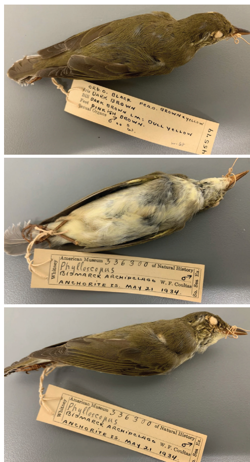
Figure 7. Specimen of the Arctic Warbler Phylloscopus borealis complex (perhaps race kennicottii ), collected by W. F. Coultas in the Kaniets, May 1934

This northern Palearctic and Alaskan breeder winters largely in South-east Asia (Lowther & Sharbaugh 2020) including Indonesia as far east as the Moluccas (Coates & Bishop 1997).