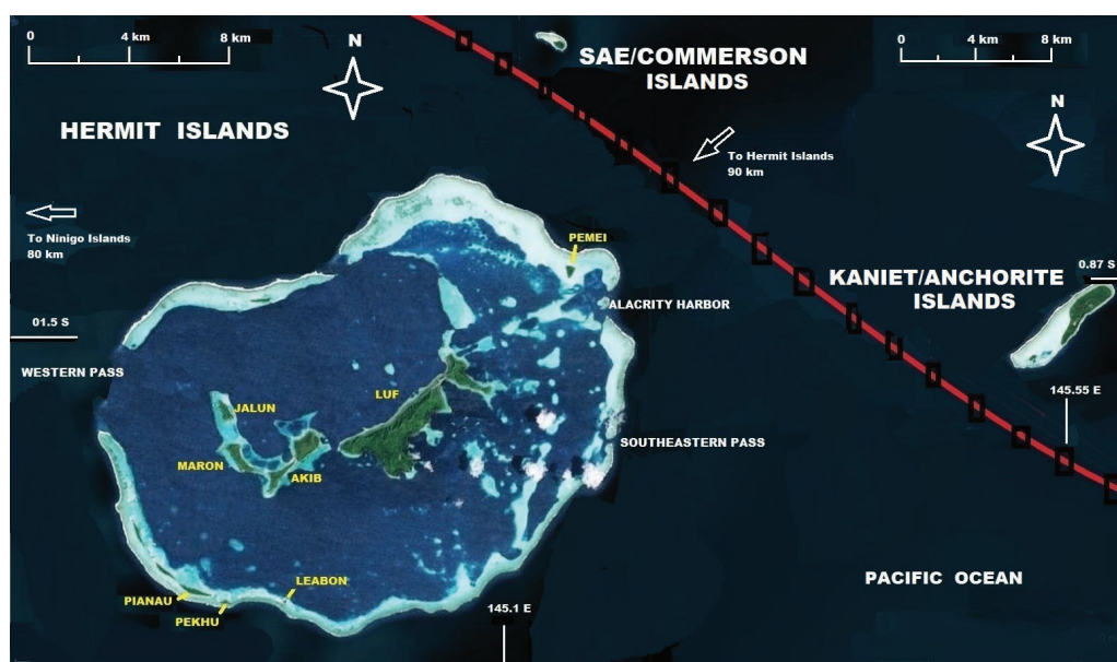
Figure 2. The Hermit Islands, showing all of the islets mentioned in the text; the Sae and Kaniet Islands are shown at a different scale (based on www.Bing.com/maps/aerial ).

covered in coconut palms, Casuarina , mangrove, Terminalia catappa and Pandanus sp., which makes penetration of more than a few dozen metres into the interior near-impossible. The south-west coralline islands support similar vegetation with tall Casuarina predominating. Dense vegetation made casual access impossible. These islands are uninhabited except three families that reside on the eastern tip of Pianau (37 ha).