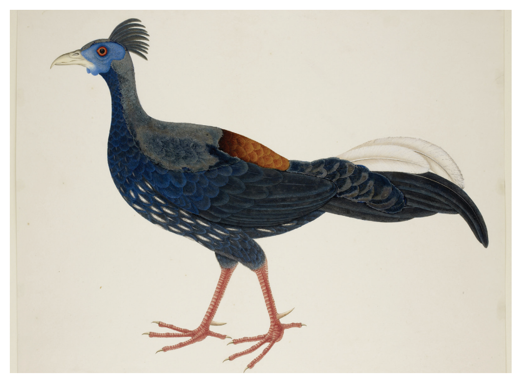
Figure 6. Malaysian Fireback Lophura\ rufa (Raffles, 1822) by J. Briois in Bengkulu, 1824 (© The British Library Board; NHD 47.44)