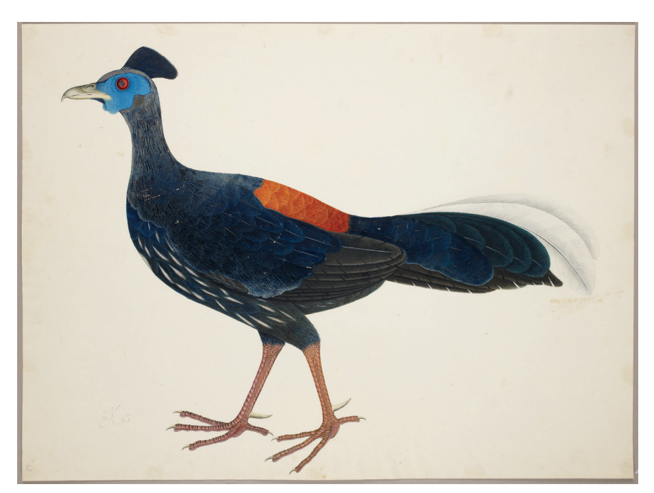
Figure 5. Malaysian Fireback Lophura rufa (Raffles, 1822) by J. Briois in Bengkulu, 1824 (© The British Library Board; NHD 47.43)