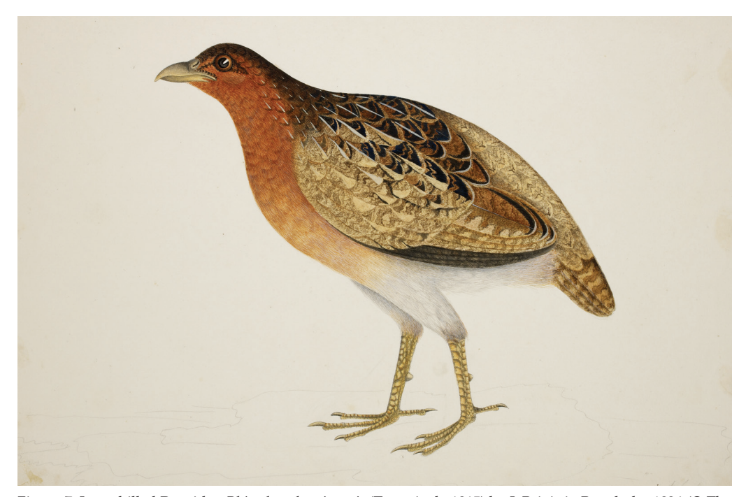
Figure 7. Long-billed Partridge Rhizothera longirostris (Temminck, 1815) by J. Briois in Bengkulu, 1824 (NHD 47.40)

In 1825, Stanley listed a male (2156) and female (2157) of 'Curve-billed partridge' under the combination of the new epithet introduced by Raffles (1822)— Tetrao curvirostris —with the genus Perdix (i.e. Perdix curvirostra ), as in Vigors' catalogue (Raffles 1830). The skins of the relaxed mounts are at NML, accession numbers D2212 (the male) and D2212b (female), and had been labelled with red tags as 'type of Tetrao curvirostra Raffles'. However, the probable collection date of these specimens (1824) would make this impossible. The two syntypes at NHMUK (female no. 1880.1.1.4552, male no. 1880.1.1.4557) are both labelled as 'co-types' on Horsfield's labels, which read ' Perdix curvirostris Raffles, Raffles, Sumatra', and recorded in the register as 'Loc. Sumatra, Pres. by India Museum (Raffles)'. Besides the ' curvirostris ' types there appear to be no other specimens of this species collected for Raffles in NHMUK. An image of a female among the post- Fame drawings (NHD 47.40; Noltie 2009; Fig. 7) could represent Stanley's specimen.