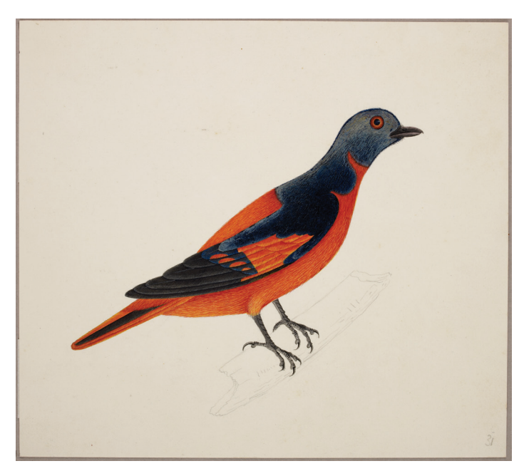
Figure 3. Scarlet Minivet Pericrocotus flammeus xanthogaster (Raffles, 1822) by J. Briois in Bengkulu, 1824 (© The British Library Board; NHD 47.31)