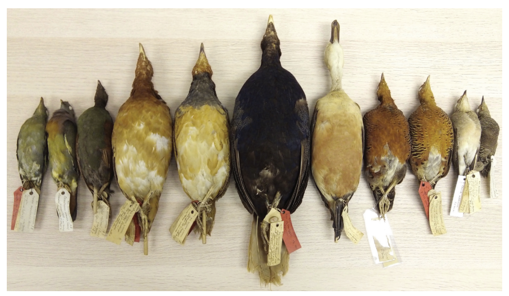
Figure 2. Specimens from Sumatra given by Sir Stamford Raffles to Lord Stanley in 1825 and extant in the collection of World Museum, National Museums Liverpool. From left: Thick-billed Green Pigeon Treron curvirostra curvirostra (NML D3636); Pink-necked Green Pigeon Treron vernans (NML D3641a); Crested Partridge Rollulus rouloul (NML D512g); Long-billed Partridge Rhizothera longirostris (female NML D2212b, male NML D2212); Crestless Fireback Lophura erythropthalma (NML D1583); Lesser Whistling Duck Dendrocygna javanica (NML D843b); Ferruginous Partridge Caloperdix oculeus ocellatus (male NML D2179a, female NML D2179); Oriental Pratincole Glareola maldivarum (NML D3192b); Buff-rumped Woodpecker Meiglyptes tristis grammithorax (NML D3791)