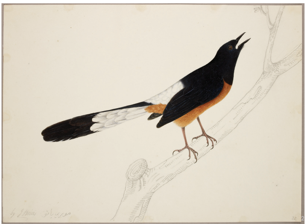
specimen. Lack of a traceable specimen in NML, or a number in Moore's stock books, suggests it was not part of the 1851 bequest.