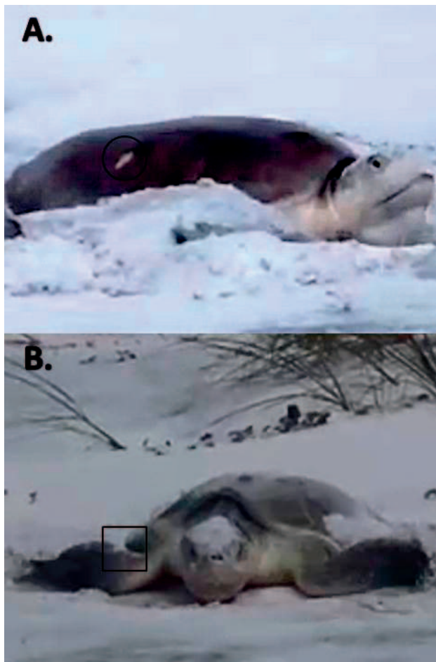
Figure 2. Head-started Kemp's ridley turtle ( Lepidochelys kempii ) that nested on South Walton Beach, Florida on 25 May 2015. Note location of a living tag on right costal scute 4, outlined in a circle (A), and a tag scar on the right fore-flipper, outlined in a square (B). (Color version is available online.)

provided by citizens (Meylan et al. 1990b, 1990c; Palmatier 1993; Bowen et al. 1994; Johnson et al. 1999; Foote and Mueller 2002; Hegna et al. 2006; Williams et al. 2006). Note that metal tags applied to head-starts as yearlings are typically missing at nesting; living tags were not applied to head-starts from the earliest year classes and, even if present, living tags can be difficult to see due to sand or algae on the carapace (Shaver and Caillouet 2015) (Fig. S2).