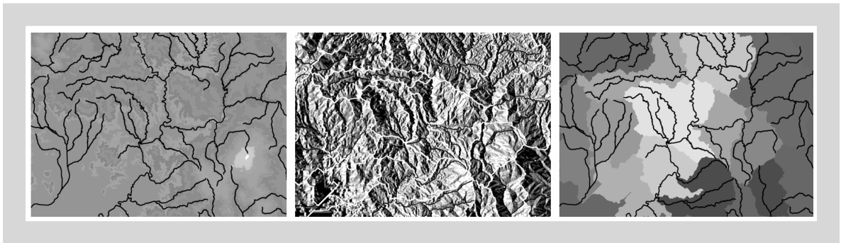
Figure 2. Given the Digital Terrain Model, GRASS can identify automatically river basins with a single command (i.e. r.watershed ).