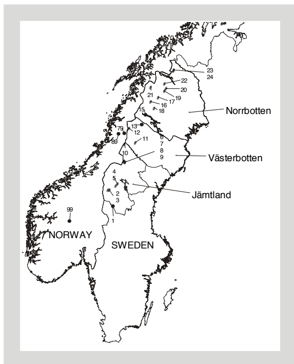
Figure 1. Location of study sites in Sweden (# 1-24) and in Norway (# 79, 89 and 99). Solid dots represent sites where harvest data on willow grouse were collected, and squares represent line-transect sites.

to be counted in any one year, and information on breeding success can still be included when planning harvest management.