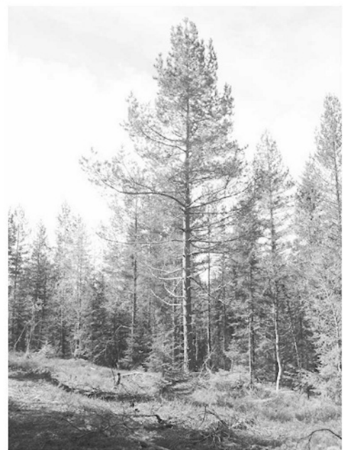
Figure 3. A 49-year-old pine tree rich in branches at Lek 7, Bikkjemyra at Nordmarka, in summer 2005. Such branch-rich trees were frequently used as roosting trees during the display season (see Table 1 for details on stand characteristics).

Age of stands ranged within 26-46 years, and tree heights within 7-12 m (see Table 1). Tree species composition varied from almost pure pine stands