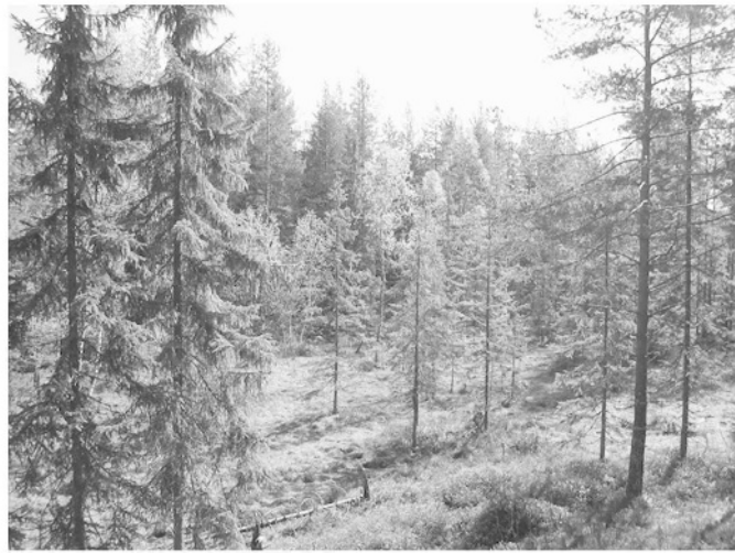
Figure 2. Central part of Lek 5, Anderstjern at Nordmarka, showing 42-year-old mixed pine and spruce forest in summer 2005 (see Table 1 for details on stand characteristics).

has been visited by > 5 females each year. We were not aware of females feeding in the area prior to lek initiation, thus, what attracted the males to the site in the first place is unknown.