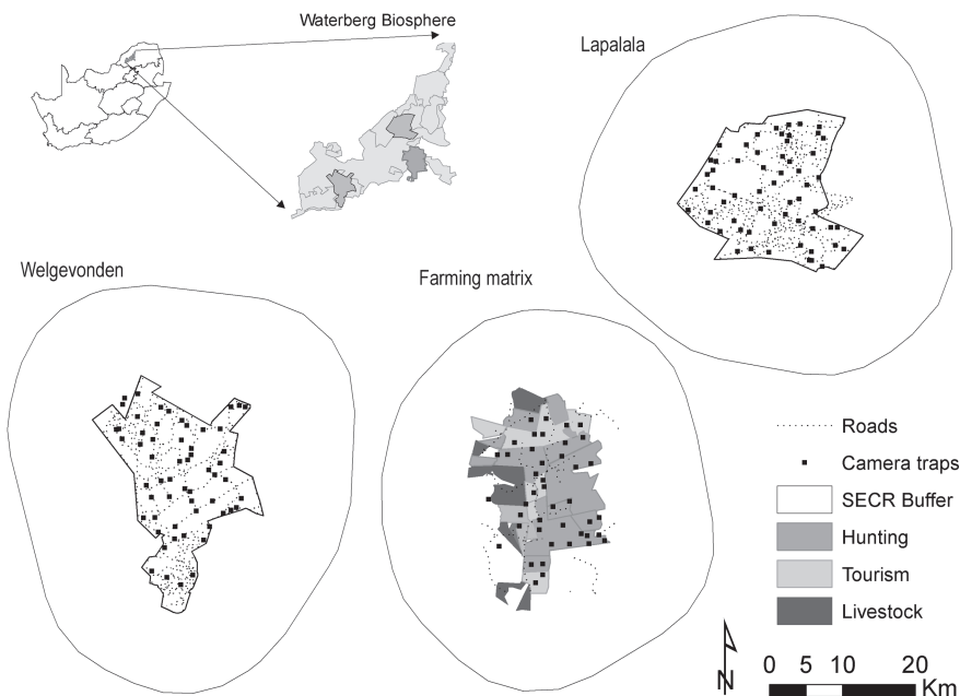
Figure 1. Location of the study sites within the Waterberg Biosphere, South Africa and camera locations within each study site as well as the buffer used in the spatially explicit mark recapture models. Shaded areas in the farming matrix indicated the different land use types.

We followed camera trapping protocols for closed population mark recapture studies on large carnivores (Karanth and Nichols 2002). Camera traps were set out in pairs in a grid with a cell size of 6.25 km 2 , which corresponds to approximately half the smallest home range diameter for leopards in mountainous areas (10 km 2 ; Smith 1978). This resulted