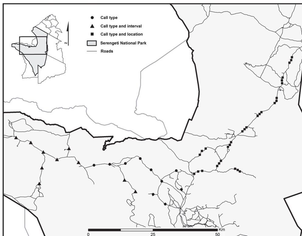
Figure 1. Sites used to elicit lion approach using broadcasted vocalizations, Serengeti National Park, Tanzania, February–April 2016.

Call-in procedures generally followed Belant et al. (2016). We broadcasted vocalizations at each site for 70 min, playing calls for 10 min, followed by a 5-min pause, and then repeated this pattern five times. Each 10-min broadcast started with 40–60 s of a single female lion, followed by 80–100 s of prey, and 40 s of a spotted hyena; this sequence was repeated three times. We broadcasted calls with maximum intensity of 110 dB using a commercial game calling system (Foxpro Inc., Lewistown, Pennsylvania, USA). We