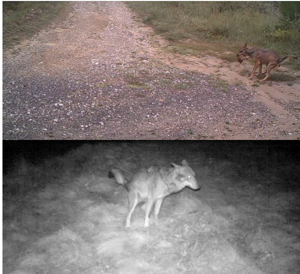
Figure 1. Two images of defecating wolves extracted from videos recorded during remote camera trapping surveys in the Arezzo province (Italy, 2013–2016).

study area – which showed both morphological and genetic signatures of introgression and were members of a breeding pair. This evidence raises a major concern, as their successful breeding would lead to a further spread of canine genes in the population. Successful mating by wolf–dog hybrids in the wild was reported in central Italy (Caniglia et al. 2013) and had previously been hypothesized on the basis of the high proportion of backcrosses observed in other areas of Italy (Randi et al. 2014). Moreover, the spread of domestic genes into the Italian wolf gene pool is particularly worrying, given that this population is sharply differentiated