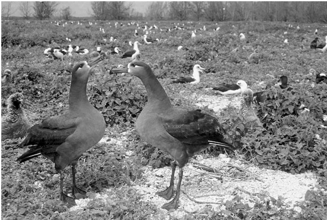
FIGURE 3. A field of Verbesina encelioides (golden crownbeard) on Eastern Island (Midway Atoll, Hawai'i) with a pair of black-footed albatross dancing in front of some Laysan albatross.

similar results comprised were found. In 1991, V. encelioides stands composed 18.2 ha, and in 2004 they comprised 60.0 ha—an increase of 230% (Laniawe 2004a). Very few areas were found where native species co-dominated the habitat with V. encelioides (Laniawe 2004a).