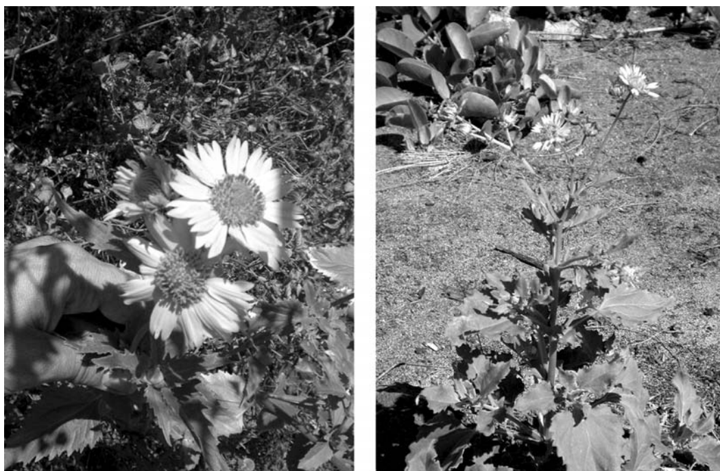
FIGURE 1. Verbesina encelioides (golden crownbeard) growing at Kanahā Beach Park near Kahului, Maui, Hawai'i.

Common names: golden crownbeard, crownbeard, golden crown daisy, wild sunflower, cowpen daisy, girasolcito, anil del muerto, yellowtop, American dogweed, butter daisy, South African daisy.