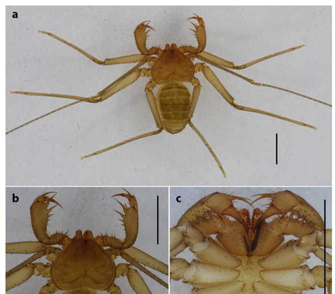
Fig. 1: Female of Charinus ioanniticus from Jordan. a. dorsal habitus, b. dorsal view of carapace and pedipalps, c. ventral view of sternum (Scale bars 2 mm)

Measurements (in mm). Pedipalp: coxa 1.0, trochanter 0.56, femur 0.94, patella 1.25, tibia 0.56, tarsus+claw 0.55. Carapace length 2.05, width 2.81; opisthosoma length 3.4, width 23.27. Leg 1 (whip) coxa (not measured because it is covered by carapace), trochanter 0.56, femur 3.86, tibia I 7.95 (22 segments), tarsus I 7.53 (37 segments). Leg 2 coxa 1.0, trochanter 0.54, femur 2.27, patella 0.45, basitibia 1.81, distitibia 1.36, first tarsal segment 0.43, second tarsal segment 0.43. Leg 3 coxa 1.36, trochanter 0.68, femur 2.95, patella 0.68, basitibia 2.27, distitibia 1.36, first tarsal segment 0.56, second tarsal segment 0.37. Leg 4 coxa 1.36, trochanter 0.68, femur 2.81, patella 0.54, basitibia 1.18, distitibia I 0.37, distitibia II 0.50, distitibia III 0.56, distitibia IV 1.35, first tarsal segment 0.56, second tarsal segment 0.50.