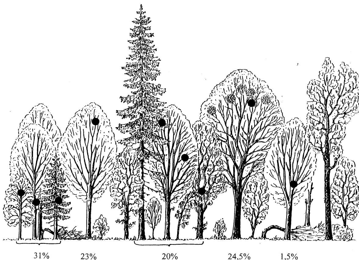
Fig. 3. Main types of the Hawfinch nest location in a high oak-lime-hornbeam forest of BNP. The illustration reprinted with the editors permission from Glutz von Blotzheim & Bauer (1997), but up-dated on larger material, N = 424 nests.

The Hawfinch nests in BNP are always placed in high and medium-size tree crowns. Of five types of nest location (Fig. 3), the four main are fairly similar structurally to each other. Most frequent (31%) are the nests at the main stem of a deciduous tree (often hidden in offshoots) or at a medium-size spruce crown. Three other locations are similarly frequent: in the mistletoe bunches, in uppermost vertical branches of old hornbeams and in branches of horizontally bent deciduous trees or on the lowest horizontal branches of huge spruces. Most exceptional (1.5%) are nests put Blackbird-like in a bifurcation of the bare main hornbeam stems, while the bush nests were not recorded at all. Disregarding described structural differences, the nests almost always were in sites with a free access from the air.