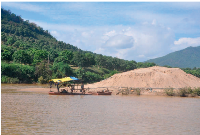
Figure 6. In-stream gravel mining, Dien Bien Province, Vietnam. November 19, 2012.

Current and planned dams in the Mekong River basin and their impacts have been summarized by Winemiller et al. (2016). Dams and reservoirs not only impact the mussel and