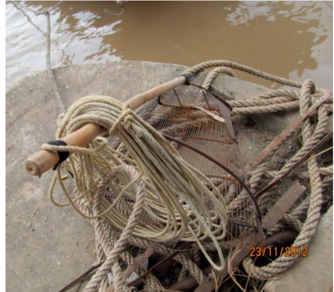
Figure 3. Small clam rake used by local fishermen to collect freshwater mussels from the local rivers. Photograph by Van Tu Do. Ca Lo River, Soc Son District, Ha Noi, Vietnam. Photograph by Van Tu Do. November 23, 2012.

Hyriopsis bialatus was listed from Malaysia, Thailand, Cambodia, southern Vietnam, and Tonkin (Brandt 1974) and recently confirmed from the Mekong Delta in Vietnam by Bogan and Do (2014b). However, Hyriopsis bialatus has been shown to be three separate species based on mitochondrial DNA sequence data with H. bialatus being described from the “in Songi flumine Malacca” (Sungi River, Malacca, Malaysia) (Zieritz et al. 2016, 2017). Sungi is the Malay