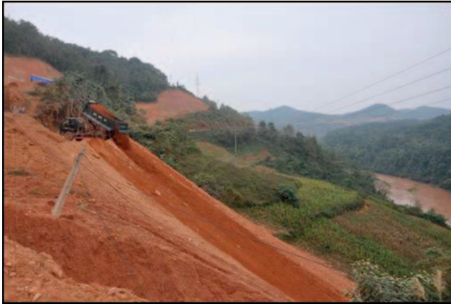
Figure 5. Road construction and disposal of debris over the edge of the road and the impact on the local river; the river is the same color as the earth being dumped. Lang Son Province, Vietnam. November 11, 2012.

mining runoff (Fig. 7), harvesting for food (Fig. 2), domestic pollution, and construction of various dams and hydroelectric projects (Fig. 8). Streams have been locally modified by restriction of channels, diversion of water for rice fields, and terracing of flood plains for rice production. Most of the large trees have been cut from the mountains, affecting the rain runoff patterns and thus affecting water temperature and clarity and increasing runoff (see Naiman and Dudgeon 2011; Zieritz et al. 2016). These modifications are impacting freshwater mussels and gastropod populations. A few species are doing well in disturbed habitats and show up in the markets as food items, including Sinanodonta spp., Cristaria plicata , Pletholophus tenuis , and Nodularia spp. (V.T. Do, personal observations).