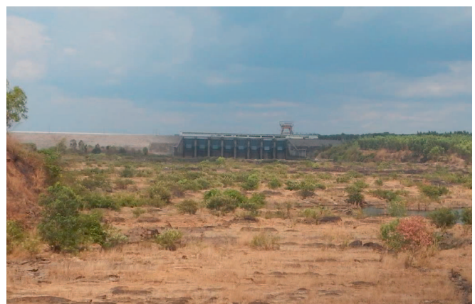
Figure 8. Dam in central Vietnam with the riverbed downstream dewatered. November 18, 2014.

Mussels are used a food item and are intensively collected in some areas of Vietnam. A local mussel harvester commented that currently he is only able to collect about 100 kg per day where in the past he was collecting 500 to 800 kg per day to sell in local markets. This decline in harvest may be due to overharvesting or mussel population declines due to a combination of overharvesting, disturbance, and pollution. Consider the number of people across Vietnam collecting mussels each day and this impact on a yearly basis is staggering. Decline in the mussel fauna of Vietnam can be considered on a local scale as well as considering the national impact on the freshwater bivalve fauna. These impacts will also impact those species that range beyond Vietnam's borders.