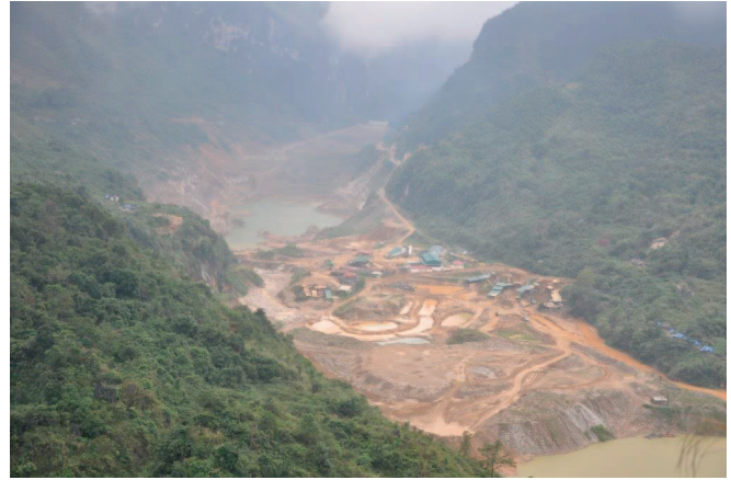
Figure 7. Open-pit mining, Cao Bang Province, Vietnam. November 13, 2012.

fish fauna in the footprint of the reservoir but also below the reservoir. Downstream of the dam (Fig. 8) water flow patterns, water temperature, and chemistry are changed and can dramatically impact mussels, their biology, and native host fish (Vaughn and Taylor 1999).