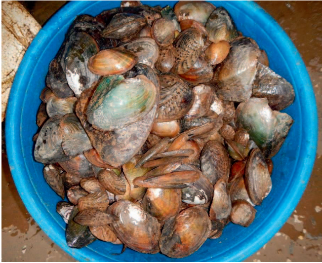
Figure 2. Pan with several unionid species for sale in a market, Ha Noi, Vietnam, Photograph by Arthur Bogan. November 18, 2014.

Vietnam by Đặng et al. (1980). Haas (1969a), Đặng et al. (1980), and He and Zhuang (2013) all placed Lamprotula mansuyi (Dautzenberg and Fischer, 1908), described from northern Vietnam in the synonymy of Lamprotula crassa . Live specimens of this species were recently collected from the Bang River, Cao Bang Province, Vietnam, for anatomical and molecular analyses (Bogan and Do 2016).