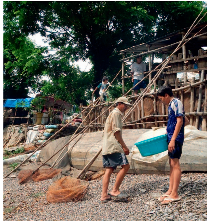
Figure 4. Long-handled rake with basket from southern Vietnam. April 4, 2014.

word for river, so the locality is unclear and Malacca referred to the southern side of peninsular Malaysia. An available name for the species occurring in the Mekong River basin is Hyriopsis gracilis Haas, 1910 (Haas 1910b). We are using H.