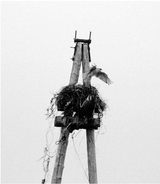
Figure 11. Wire nest on an abandoned power pole occupied by Saker Falcons, southeastern Mongolia, 5 June 1997.

Two other Golden Eagle nests were near human activity. One was within 90 m of a paved and busy highway along the White River in western Colorado and within 210 m of, and in view of, an occupied farm house. The condition of the excrement and