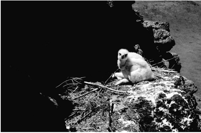
Figure 16. A rudimentary Golden Eagle nest in southeastern Mongolia photographed 11 June 1998. Eaglet rests on rock substrate.

the Colorado River. When inspected from the cliff rim, on 2 May 2000, a single young eaglet (age ca. 30 d) lay on a flat sandy shelf; no sticks other than the basal limbs of the shrub were visible. A sizeable stick nest was available at a distance of ca. 200 m.