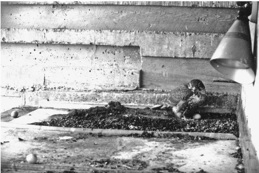
Figure 8. First documented nesting of Prairie Falcons on a building. Yearling Prairie Falcon at her scrape at the University of Calgary, 1 May 1974. Her third egg is in the scrape. The first and second are scattered about the metal ledge.

courting. The first egg was laid on 26 April in a thin layer of dried pigeon (Rock Pigeon [ Columba livia ]) manure on sheet metal in a back corner of a large, north-facing cavity (ca. 4 m \times 1.3 m \times 1.6 m high) just above the upper floor (Fig. 8). Rain turned to