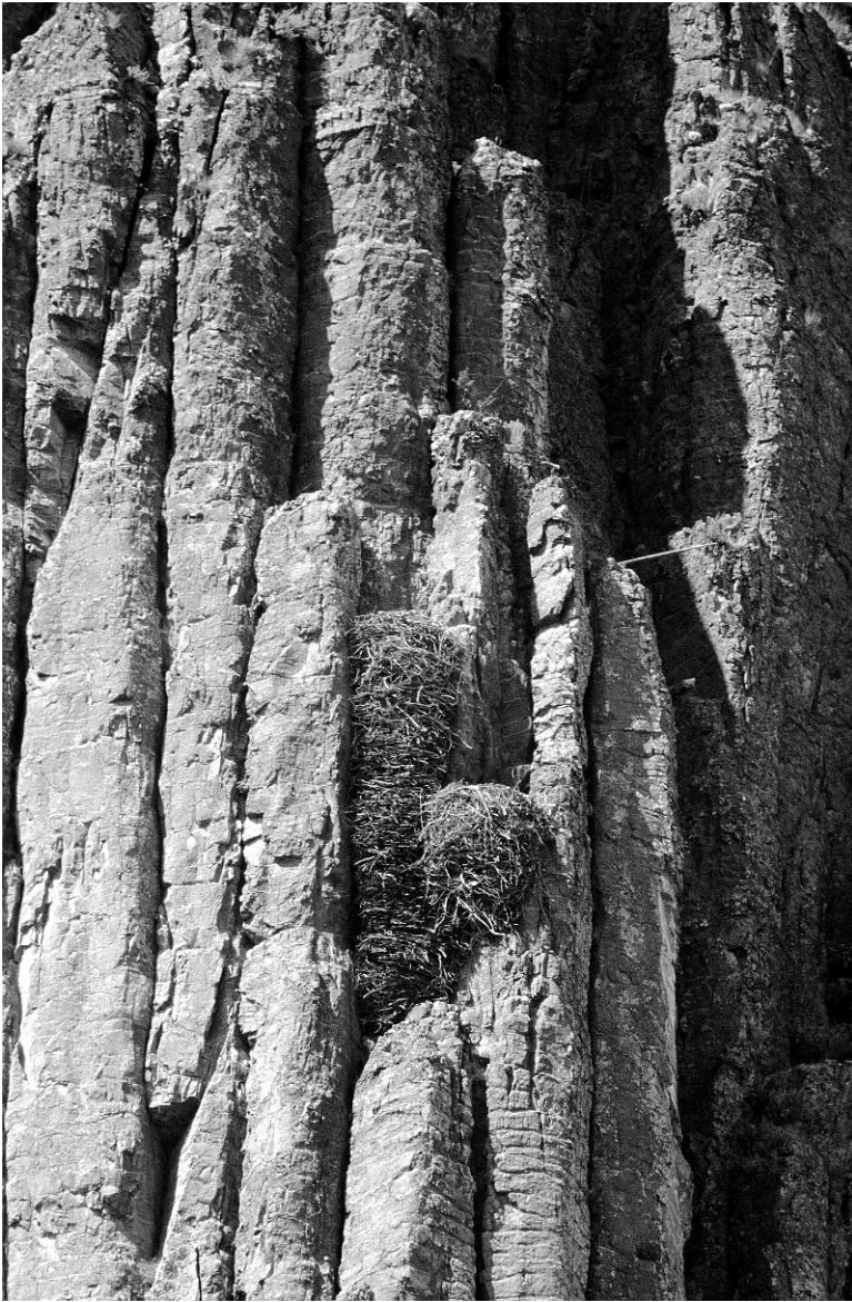
Figure 15. Sun River Golden Eagle nest in central Montana, 30 August 2002. In 2004, an extreme height measurement of the left, larger nest was 7.0 m.

to have been used in recent years, many molted Golden Eagle feathers were found at the cliff rim, and a lone adult was present on one of three visits.