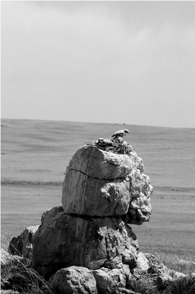
Figure 17. Saker Falcon eyrie atop a 1.7-m boulder in southeastern Mongolia, 12 June 1997.

ground nests are extremely rare. Exceptional records include Barred Owls in both Michigan and Florida (Postupalsky 2001) and Bald Eagles in Michigan (Brigham 1939). For both of these species, elevated nesting sites were readily available. Another (albeit unsuccessful) ground nesting of Bald Eagles took place in an open stubble field ca. 60 m from a regularly used dirt road in Ohio in 1976. Ground nesting on the open steppe is common in the Steppe Eagle, and Golden Eagles infrequently nest