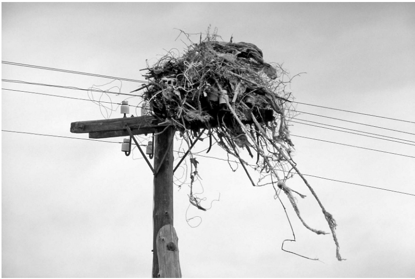
Figure 9. An extreme example of an Upland Buzzard trash nest in southeastern Mongolia, 4–5 June 1995.

wet snow overnight with temperatures just below freezing. The following morning, the single egg lay on bare metal. After waiting until the female left the ledge, we spread sand on the ledge and placed the egg in a shallow depression. Following the blizzard, the male ceased his courtship and food deliveries. People then provided the female with ground squirrel ( Citellus sp.) carcasses, which she ate. She laid three more eggs, but they were soon scattered about the ledge and disappeared one by one. Only one egg remained when the female finally abandoned the ledge. On sunny days in mid-May, the pair resumed courtship, including copulations, but no replacement clutch was laid, and no breeding attempt was made there in subsequent years.