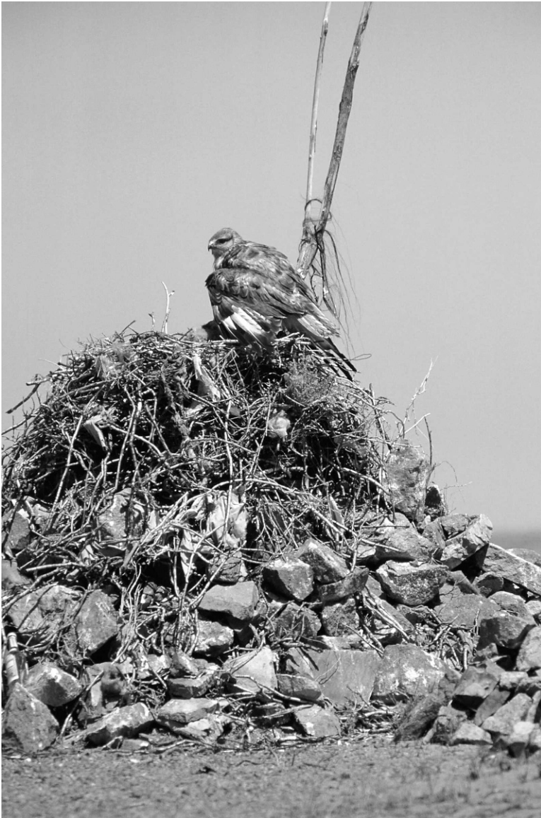
Figure 22. Upland Buzzard nest on a mountaintop shrine, southeastern Mongolia, 11 June 1997. Note that this nest, far from human activity, is built almost entirely of natural vegetation.

At two Golden Eagle nests in central and one in southeastern Mongolia, we noted that some sticks were larger than normally seen in eyries, so we measured the four largest. At one eyrie, the largest stick accessible (i.e., not buried in the matrix) was 2.31 m long (chord) and 2.76 m (along the curvature). Its circumference at base (hereafter "circ. b.") was 11.6 cm (3.7 cm diameter). At another eyrie, the largest accessible stick was shorter (97.8 cm [chord];