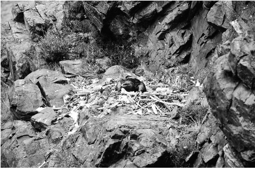
Figure 23. Steppe Eagle nest in northwestern Mongolia composed primarily of bones of large mammals, 25 June 1994.

mented by Grubb and Eakle (1987) for 12 Golden Eagle nests in Arizona.