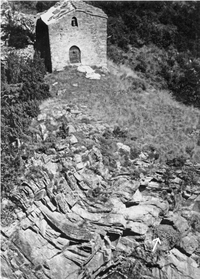
Figure 13. Remote chapel in Catalonia, Spain, with nearby Golden Eagle nest (arrow). Photograph: September 2003, Antoni Margalida.

falcons nested horizontally only ca. 10–20 m from the ravens. However, these nests were 120 m apart vertically; the falcon eyrie was ca. 40 m from the top of the 210-m cliff and the raven nest was ca. 120 m below the falcons. When nesting in areas frequented by Golden Eagles, peregrines and ravens often nest commensally in the “distant vicinity” of each other (Sergio et al. 2004). Either species can warn of an eagle attack, and both mob eagle intruders.