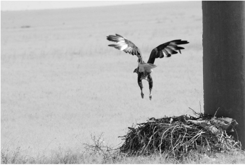
Figure 5. Many Upland Buzzard nests, especially in eastern Mongolia, are placed on the ground next to power or telephone poles. Where poles have sufficient arms and wires to support a nest, ground nests are seldom encountered (May 2008).

100 m of an active fossil fuel pumping station southwest of Powder River, Wyoming.