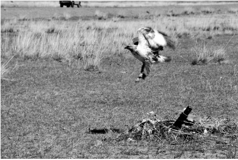
Figure 3. This Upland Buzzard nest (central Mongolia, 26 May 1995) is located at the base of a steel rod emerging from the ground.

nestlings follow the daily path of the pole's shadow. The need for shade also explains the placement of Lanner Falcon ( F. biarmicus ) eyries amid metal rubbish on the open Sahara Desert (Goodman and Haynes 1989).