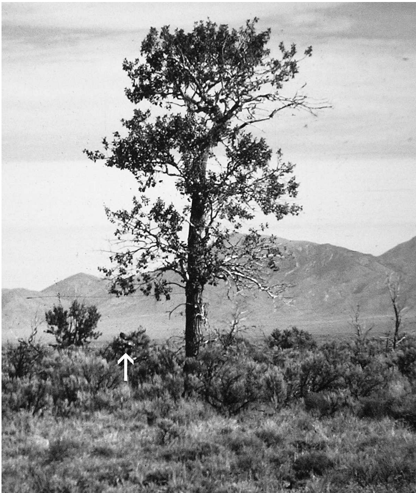
Figure 20. Swainson's Hawk nestlings (arrow) ca. 1 m aboveground in a sagebrush near Howe, Idaho.

usual raven nests, both from Mongolia, built almost entirely of rib bones. The outer rim of a nest (ca. 75 cm wide, 42 cm deep) found 24 June 1994 at the mouth of the Hobolnoor River in extreme north-western Mongolia was almost exclusively constructed of rib bones (probably of domestic animals). Evidence at the site indicated that ravens had recently fledged. The second rib nest was found in central Mongolia on 1 July 1998 (Fig. 24). It was then ca. 60 m from an active Saker Falcon eyrie (also in a probable raven nest). In 2008, sakers fledged at least three young from the rib nest. By 2008, about a fourth of the bones had fallen: below the nest, we counted 220 ribs or large rib fragments (>10 cm in length) and noted thousands of smaller