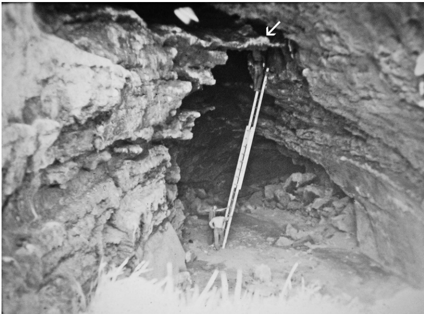
Figure 18. Prairie Falcon eyrie (arrow) recessed ca. 10 m from the opening of a lava tube on the Snake River Plain of Idaho. Pale streak is an adult falcon.

where foxes (two species) and wolves are widespread, most Golden Eagle nests are on cliffs, but we have found six nests on boulder-strewn hillsides, and two on flat ground at the very edge of a cliff, where a mammalian predator could easily walk to the nest.