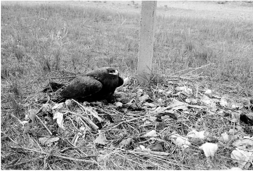
Figure 12. Adult Steppe Eagle attending eaglet and egg at the foot of a concrete post between the most actively used lanes of a dirt road in eastern Mongolia, 12 June 1995.

nest materials during a July 2006 visit indicated the nest was in use as late as 2005. The second pair (central Mongolia) nested in 2008 only 15 m from a footpath to a regularly visited, mountaintop shrine. Although this nest (with one nestling) was over a ridge top from the path, three alternate nests were on the same side of the ridge as the path and within ca. 35 m of it. All four nests were decorated with silk scarves and other cloth associated with people visiting the shrine.