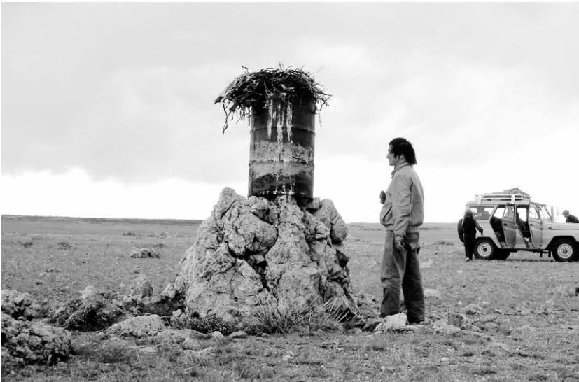
Figure 6. Upland Buzzard nest atop a metal barrel, southeastern Mongolia, 7 June 1998. D. Batdelger is pictured.

Although Prairie Falcons ( F. mexicanus ) nest almost exclusively on cliffs (Steenhof 1998), we have one record of nesting on a building. Following two