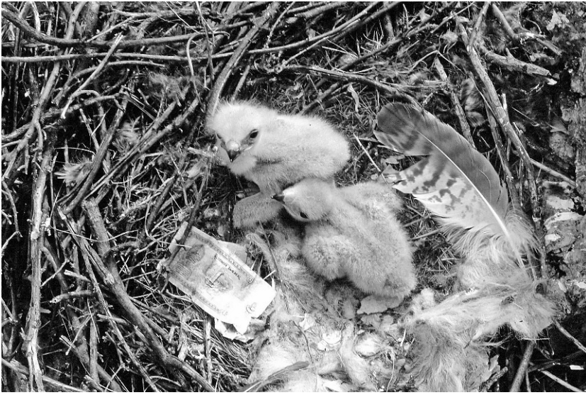
Figure 10. Paper money (two bills) line the cup of this Upland Buzzard nest, eastern Mongolia, 14 June 1995.

vegetation, we concluded that it arrived as nesting material, not as an attachment to mammalian prey.