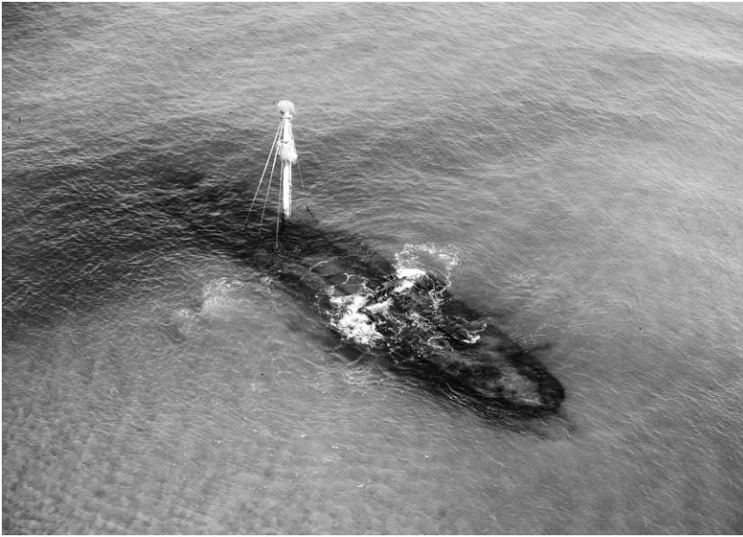
Figure 1. Osprey nest on the mast of a sunken boat, southern Baja California, 27 March 1977.

2000) are worth publishing. Our emphasis is on providing photographic documentation of some of the most unlikely records.