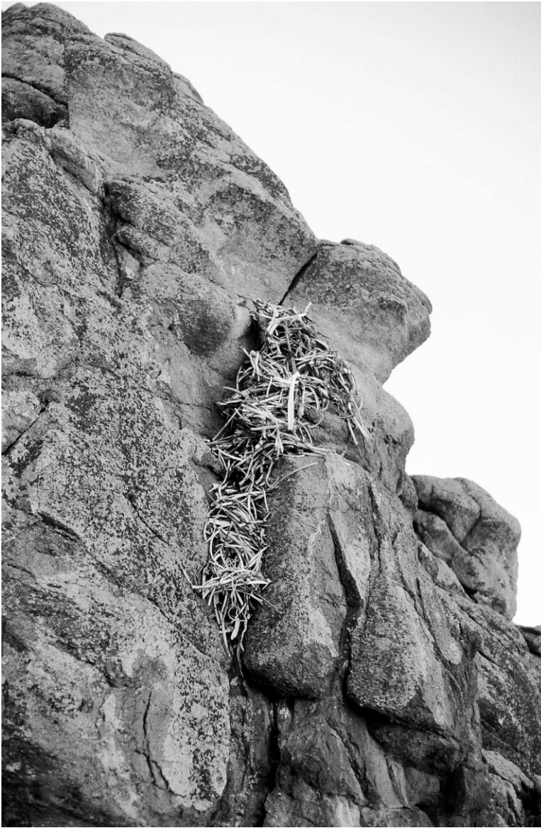
Figure 24. Common Raven nest (1998, central Mongolia) composed primarily of rib bones of large mammals. This nest was used in 2008 by Saker Falcons.

Geological Survey Southwest Biological Research Center, and Bureau of Land Management, Central Yukon Field Office.