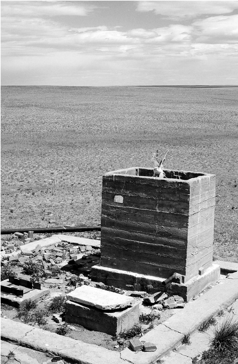
Figure 2. Adult Saker Falcon leaving the cistern eyrie, southeastern Mongolia, 8 June 1998. The hole was punched through the wall in June 1997 so the nestlings could fledge.

on foot without climbing) on easily accessible hill-sides or even on the open steppe. In wolf ( Canis lupus ) and fox ( Vulpes spp.) habitat, such nests would seem likely to fail, but fledged young are regularly seen in and around these structures. Strangely, ground nests are occasionally seen immediately adjacent to conspicuous artificial objects. One surrounded a ca. 70-mm-diameter iron rod emerging from the steppe (Fig. 3). Another nest