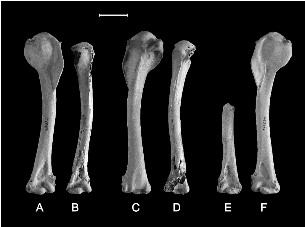
Figure 4. Left humeri of Caracara (A, B, E, F, anconal view; C, D, palmar view). A, C, F, C. plancus USNM 490931; B, D, C. tellustris , new species, USNM 535726; E, C. tellustris , new species, USNM 535730. Scale = 2 cm.

Even with nearly complete skeletal material it is often difficult to predict from morphology whether a bird with reduced pectoral girdle and appendages would have been completely flightless. Caracara tellustris would have had at best very reduced powers of flight and probably led a nearly completely terrestrial existence, both foraging and dispersing on foot.