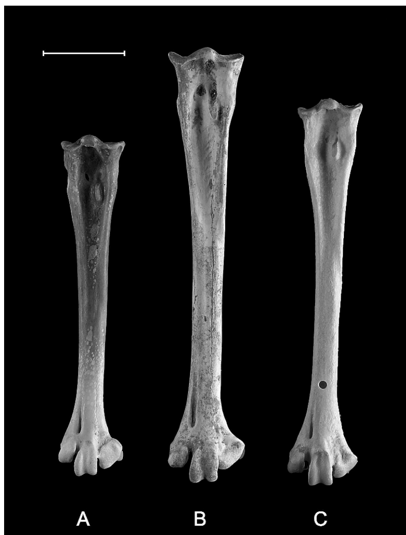
Figure 1. Right tarsometatarsi of caracaras in anterior view. A, Phalcobaenus australis USNM 490979; B, Caracara tellustris , new species, holotype USNM 535727; C, C. plancus USNM 490931. Scale = 2 cm.

itative characters, as those previously thought to distinguish the two (Campbell 1979, Suárez and Olson 2003) appear to have been compromised by certain fossil material from Peru (W. Suárez and S. Olson unpubl. data). Nonetheless, the Jamaican bird is so large that it is unlikely to have been derived from any of the small, delicate species of Daptrius/Milvago .