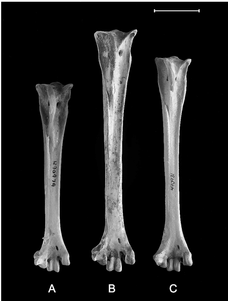
Figure 2. Right tarsometatarsi of caracaras in posterior view. A, Phalcobaenus australis USNM 490979; B, Caracara tellustris , new species, USNM 535727; C, C. plancus USNM 490931. Scale = 2 cm.

Paratypes. Skeleton Cave, Map Room: left humerus USNM 535726. Lloyd's Cave, Pit #1, Mantrap Entrance: right coracoid USNM 535725. Drum Cave, surface contents: proximal third of left humerus USNM 535723; shaft of right tibiotarsus. Jackson's Bay cave system, exact cave uncertain: distal half of right humerus USNM 535730; right tarsometatarsus USNM 535728; left pedal phalanx 1 of digit I USNM 535729.