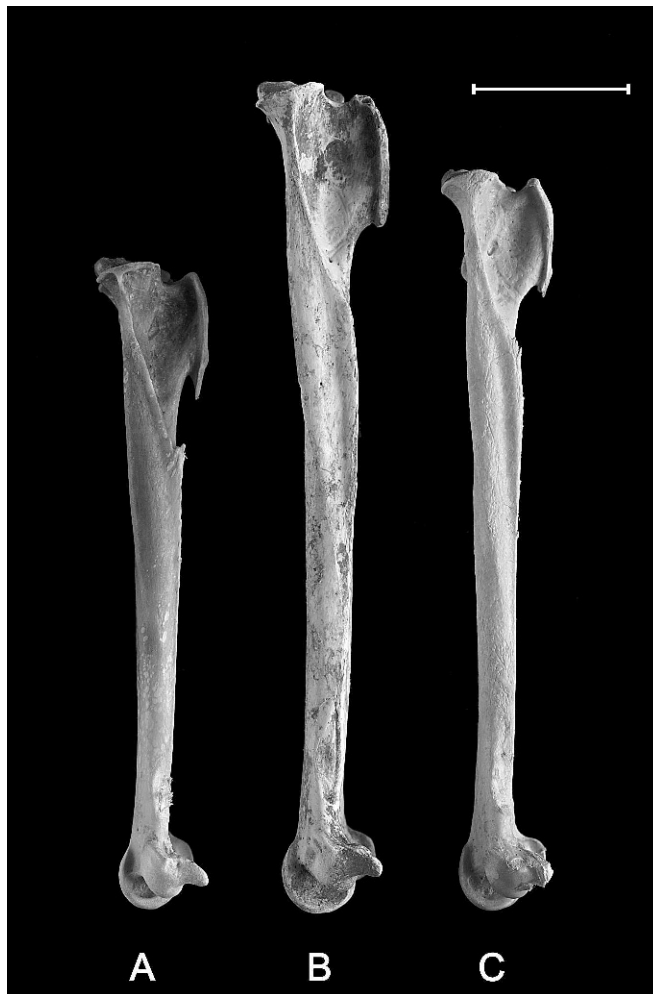
Figure 3. Right tarsometatarsi of caracaras in medial view. A, Phalcobaenus australis USNM 490979; B, Caracara tellustris , new species, USNM 535727; C, C. plancus USNM 490931. Scale = 2 cm.

more distinctly set off from the rest of the trochlea. The large size of phalanx 1 of the hind toe (Fig. 5E) indicates that the foot was correspondingly large as well.