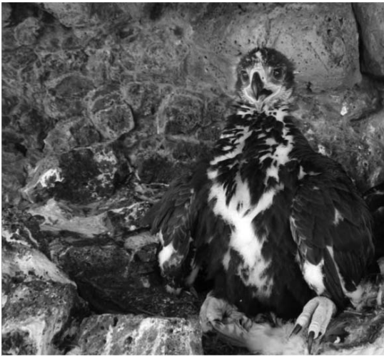
Figure 2. Photograph of a 51-d-old Golden Eagle nestling, first observed within 1 d of hatching. See also Plate 12 in Driscoll (2010) for an image of a 7.5-wk-old eaglet.

Postupalsky (1974) defined a productive or successful nest as one from which at least one young fledged, or if actual fledging was not observed, one in which at least one young was raised to an advanced stage of development (i.e., near fledging age). Ideally, this advanced stage of development should be defined consistently within a species to allow valid comparisons among studies. It would be misleading to compare results from a study that considered nests with downy young to be successful (e.g., Moss et al. 2012) to one that classified nests as successful only if and when young actually fly from the nest on their own volition (e.g., Beecham 1970).