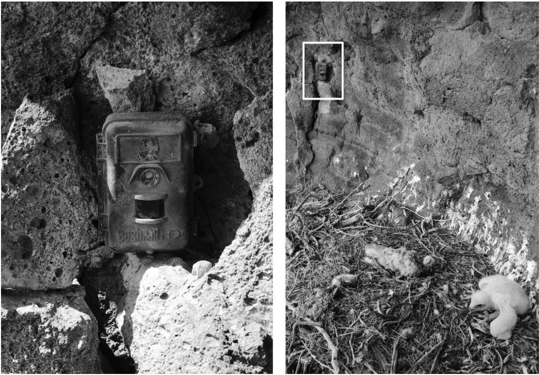
Figure 1. Image of a motion-activated camera installed to monitor Golden Eagle diet and productivity. The camera is concealed in a rocky crevice (left) and is flush against the cliff at a distance of >2 m from the nest (right, camera is highlighted by white box).

was no evidence of adults returning to the nest, we removed the cameras.