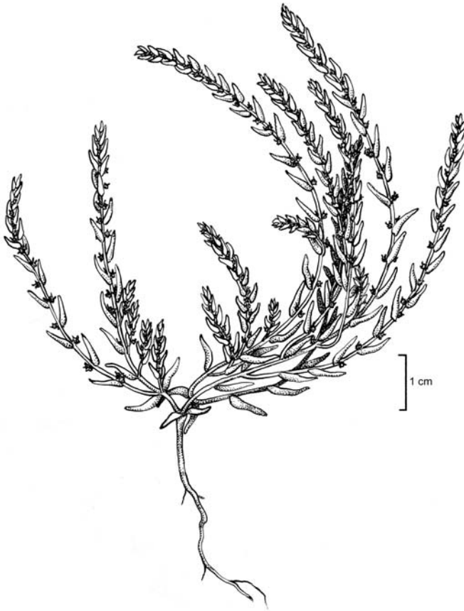
Fig. 1. Suaeda tschujensis Lomon. & Freitag; one of several individuals of the collection Korolyuk 82 (NS). – Drawing by N. Prijdak.