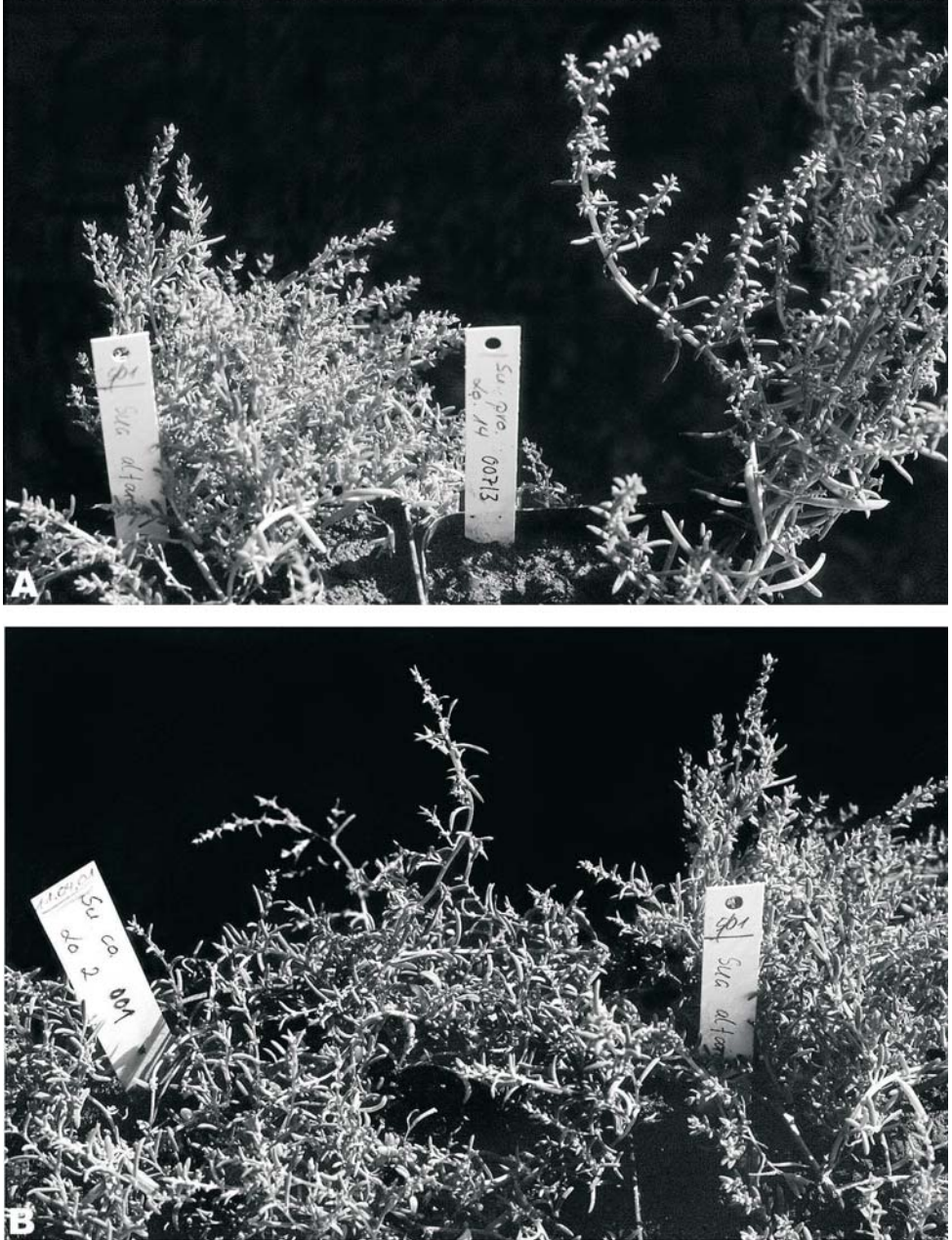
Fig. 3. Suaeda tschujensis Lomon. & Freitag cultivated side by side with related species – A: with S. prostrata (on the right); B: with a delicate prostrate form of S. corniculata (on the left). – Photos by H. Freitag.