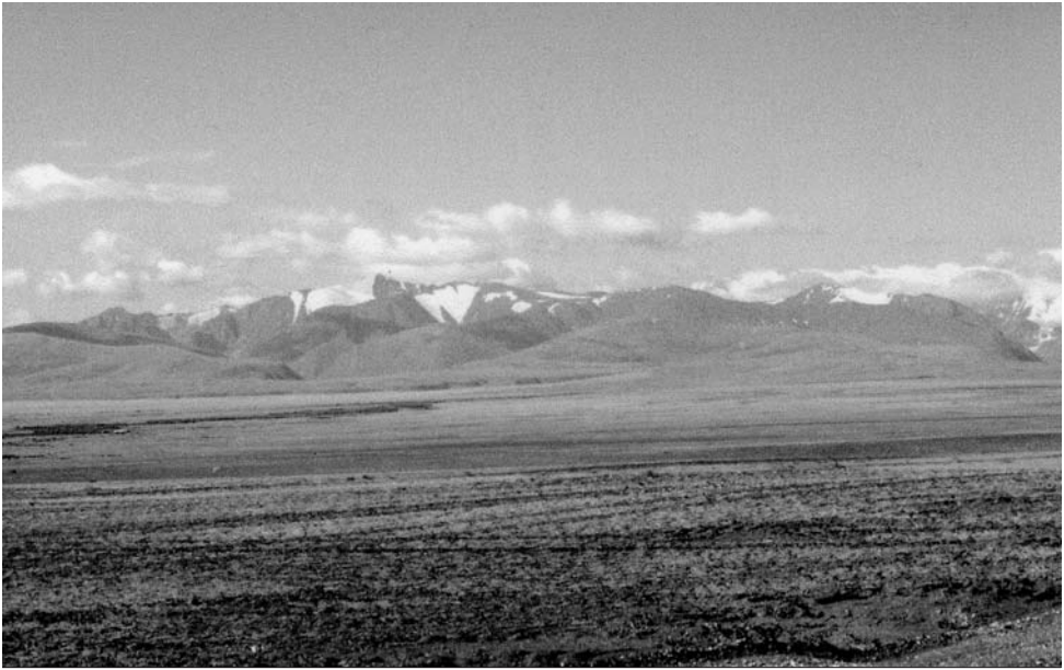
Fig. 4. Chuya steppe in the Altai Mts, near Kosh-Agach, c. 1750 m; view in SW direction towards the S Chuya Mts.

new species is restricted to a few larger intramountain depressions at altitudes of 1750-2000 m (Fig. 4), characterized by an extremely continental and dry climate resembling the high plains of the Pamir. The annual mean temperature (data from Kosh-Agach) is at -6\text{ }^{\circ}\text{C} and might drop to -9\text{ }^{\circ}\text{C} nearby. The mean of the warmest month (July) is 14.2\text{ }^{\circ}\text{C} and of the coldest month (January) -31.5\text{ }^{\circ}\text{C} . The vegetation period is very short and free from frost only for about 25-35 days. Annual precipitation varies from 70 to 170 mm, with a distinct maximum in summer. The thickness of the snow cover is 10-12 cm but frequently the snow is blown away by strong winds. Permafrost was observed in some parts of the Chuya depression.