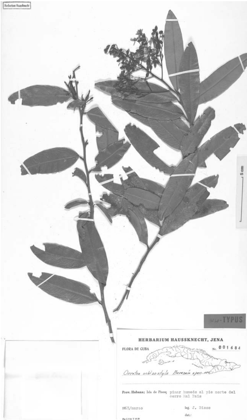
Fig. 1. Ouratea schizostyla , holotype specimen.