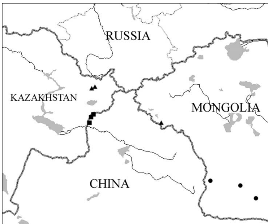
Fig. 2. Distribution of Erysimum mongolicum (●), E. vassilczenkoi (■) and E. kotuchovii (▲).

E. mongolicum are covered with tight, almost exclusively transversely oriented, sessile, medi-fixed 2-rayed (malpighiaceus) trichomes with an inconsiderable admixture of sessile 3-rayed trichomes along the septum margin and on the midrib, occasionally on the valve surface. The indumentum is so dense that the valve surface is completely covered and silvery. In contrast, the fruit valves of the specimens from Dayan-Nuur are covered with moderately dense malpighiaceus trichomes mixed with rather numerous 3-rayed ones common all over the valve surface. Most unusual is the orientation of the malpighiaceus trichomes: these are oriented transversely, or parallel, or obliquely to the length of the silique, and often trichomes of different orientation are mixed on a single fruit. For these peculiarities, the collection can only be attributed to the recently described E. kotuchovii D. German from the Kazakhstani Altai (German 2004).