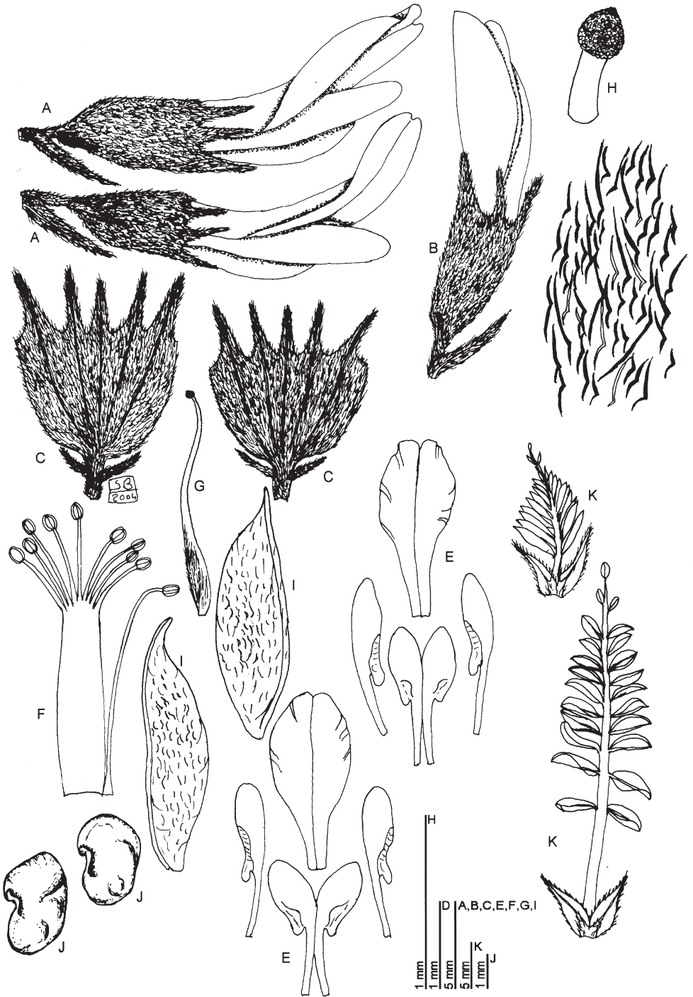
Fig. 3. Astragalus greuteri – A: flowers; B: flower bud; C: open calyxes; D: calyx indumentum; E: petals; F: stamens; G: pistil; H: stigma; I: legumes; J: seeds; K: leaves. – Drawn after material from Col di Bavella (locus classicus).