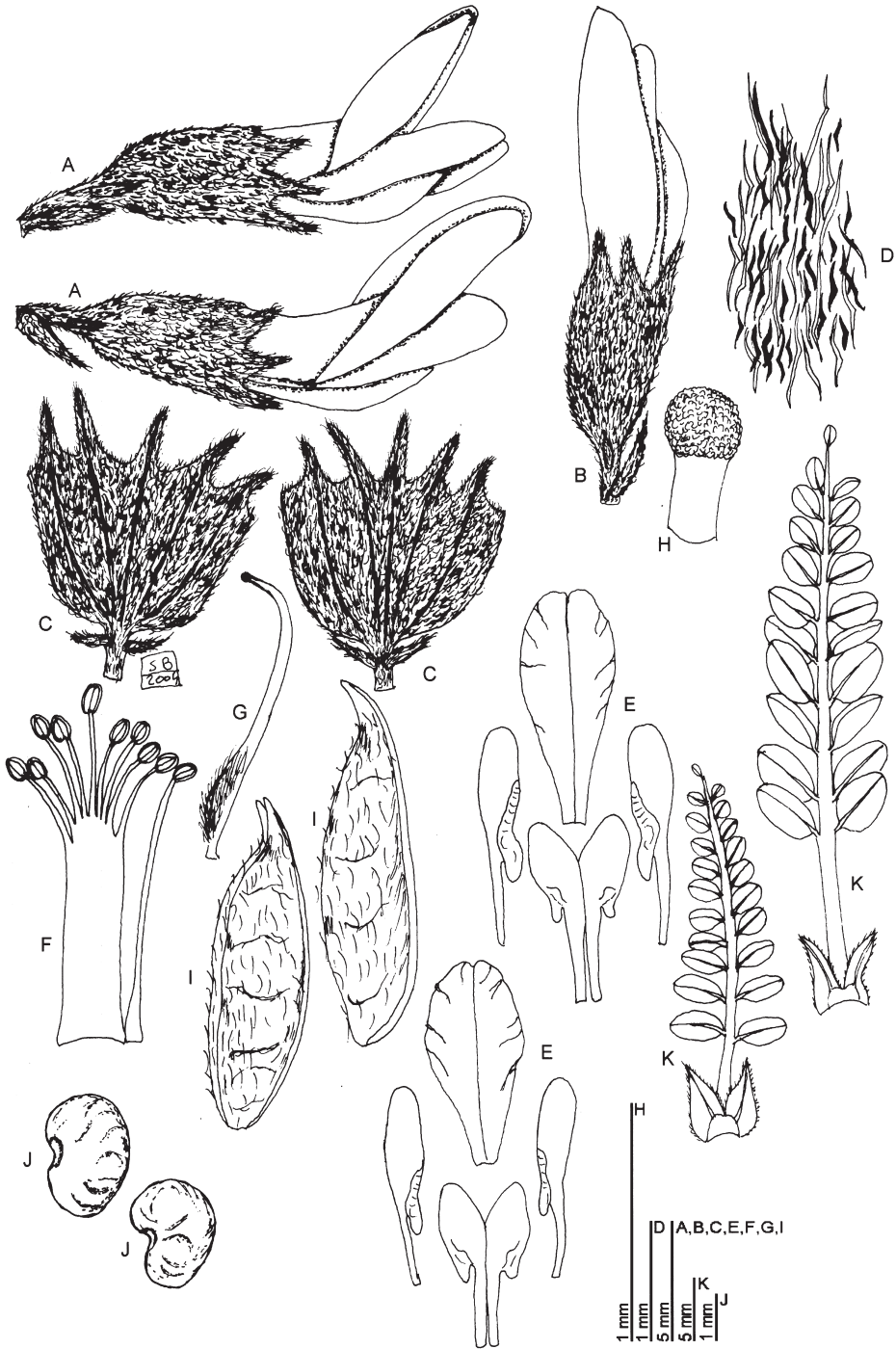
Fig. 1. Astragalus genargenteus – A: flowers; B: flower bud; C: opened calyces; D: calyx indumentum; E: petals; F: stamens; G: pistil; H: stigma; I: legumes; J: seeds; K: leaves. – Drawn after material from Bruncu Spina in Mt Gennargentu (locus classicus).