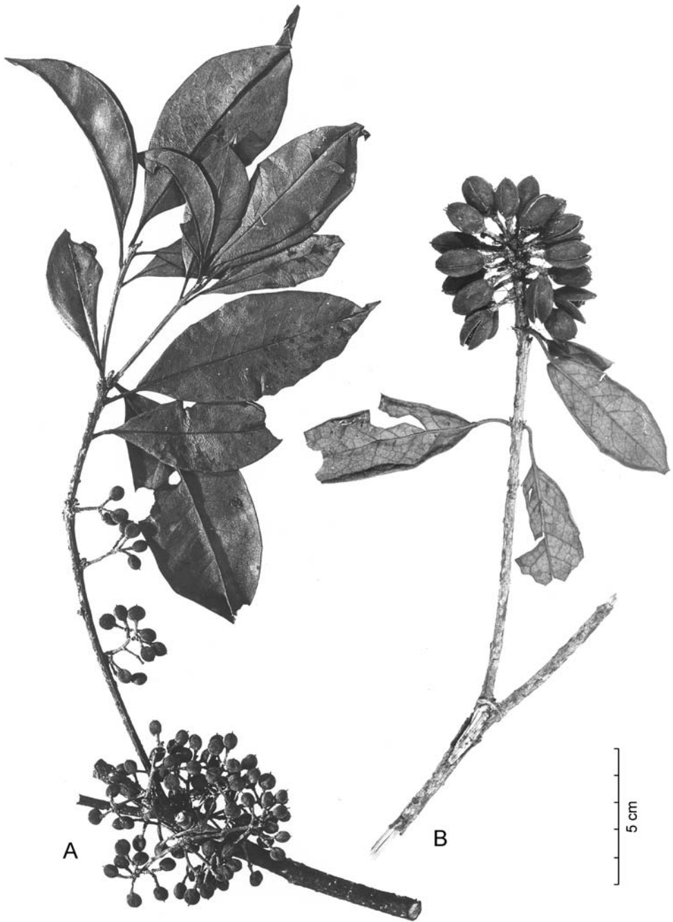
Fig. 2. Eipo name mena for two very different species – A: Pittosporum ramiflorum (Zoll. & Moritzi) Miq. (Hiepko & Schultze-Motel 1446); B: Pittosporum pullifolium Burkill (Hiepko & Schultze-Motel 1216).